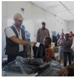
UNHCR's partner LibAid distributes school bags to internally displaced children at the Airport road IDP camp and the Falah IDP Camp. 20 September, 2015