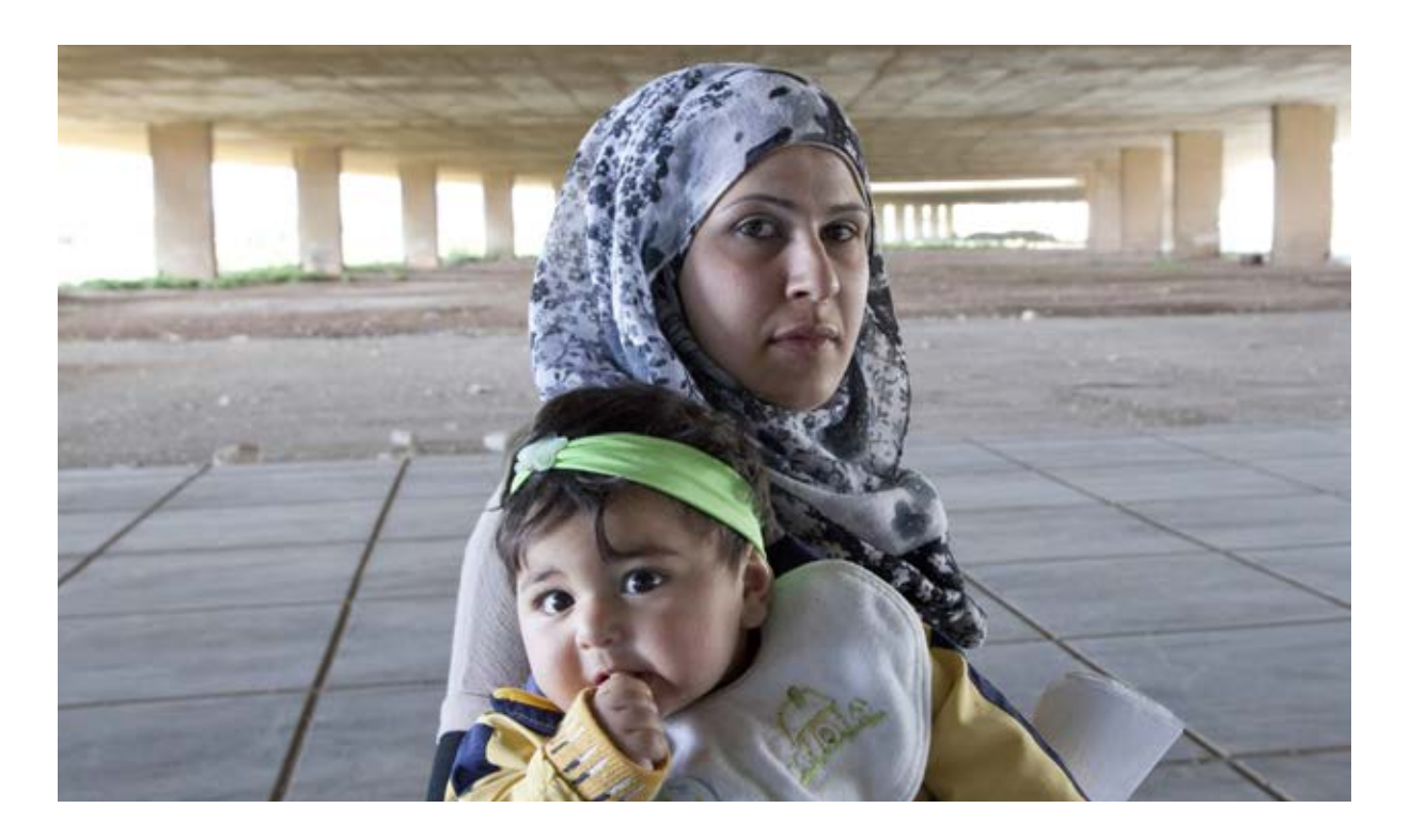
Cradling her daughter, a Syrian mother waits to register for assistance in Tripoli, Lebanon. Her husband is missing.

unaccompanied and separated children. This involved tracing and reuniting children with family members in Jordan or abroad, identifying safe and appropriate care arrangements with extended family or other members of the community, and assessing existing care arrangements to ensure that they were suitable and safe.