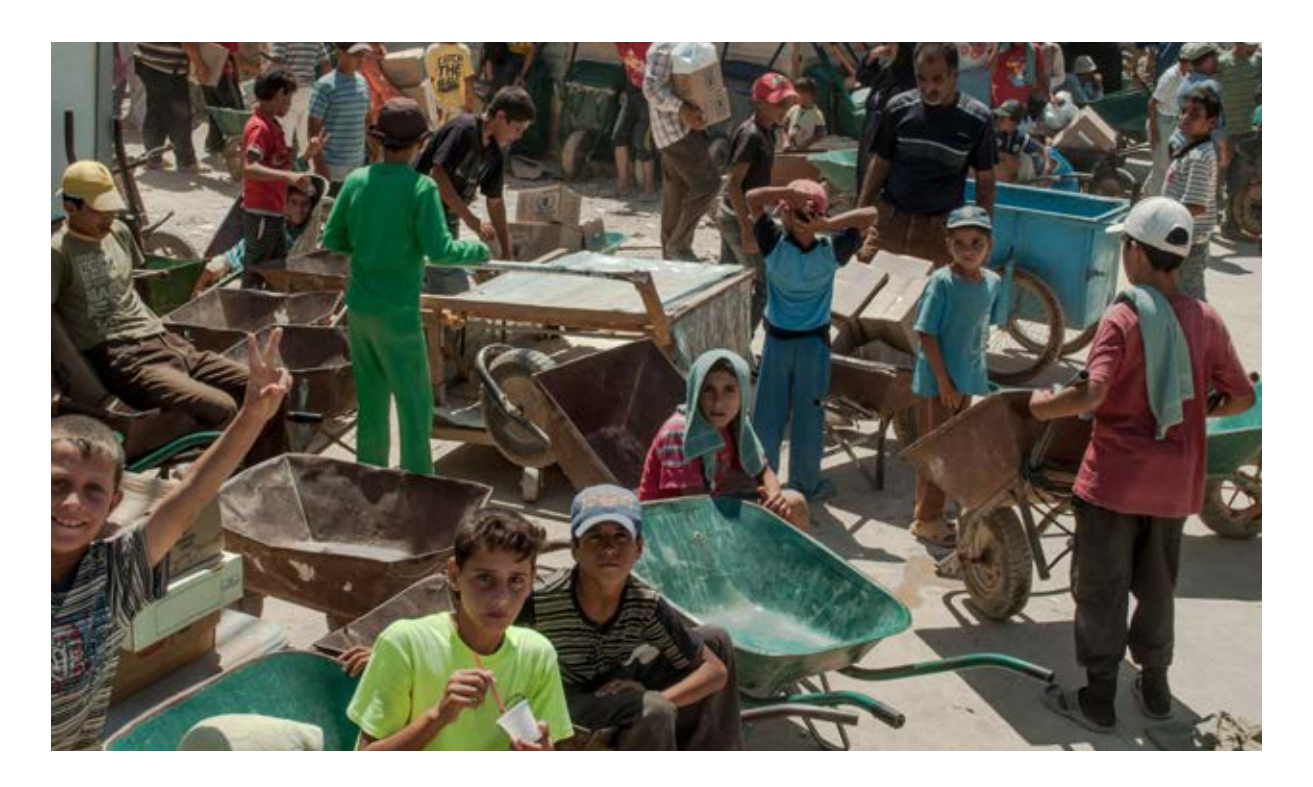
Syrian refugee children line up for work in Za'atari refugee camp in Jordan.