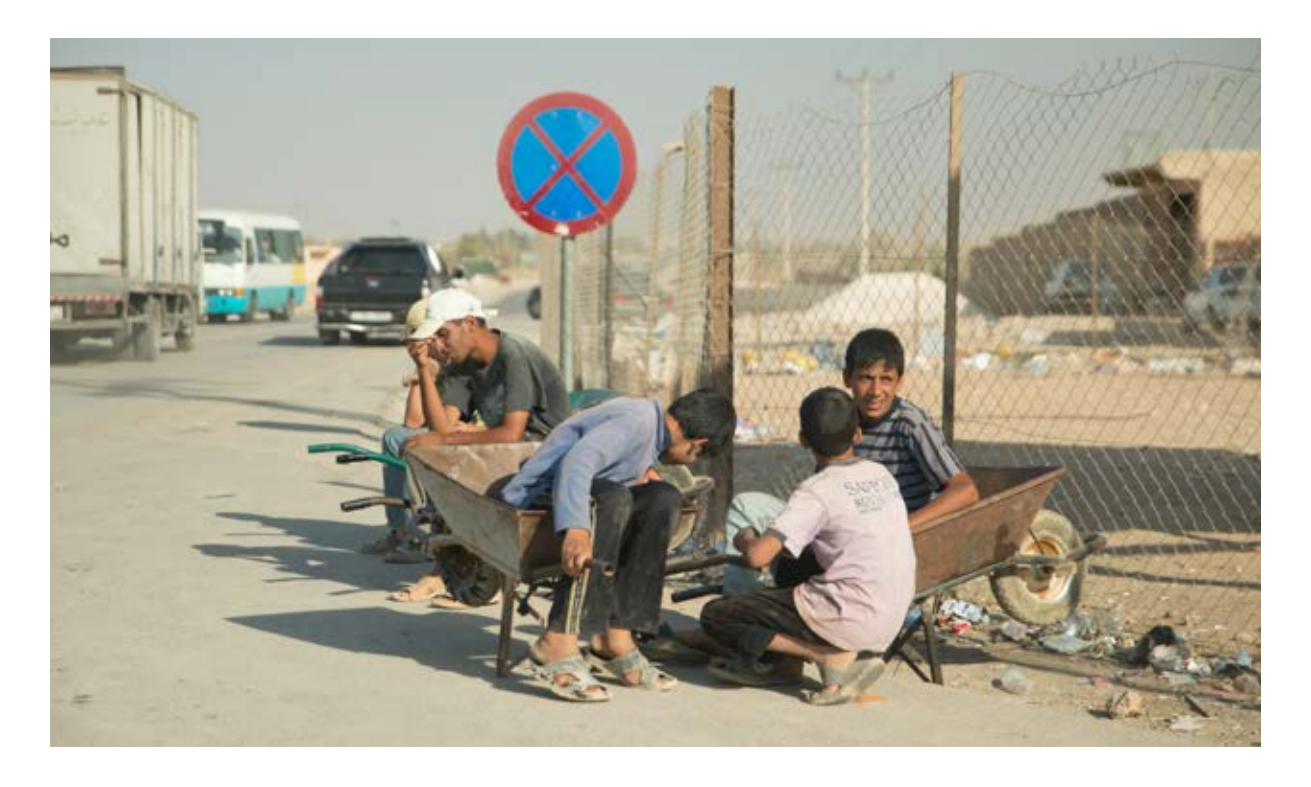
Syrian refugees sit with their wheelbarrows outside the gate of Za'atari refugee camp, waiting for odd jobs pushing loads.

families, it is often not possible to find a way for children to stop working. In such situations, case managers also interact directly with children's employers to minimize the risks they face in the workplace. This can include providing materials to improve their safety at work and negotiating with employers to ensure they can access at least informal education alongside work.