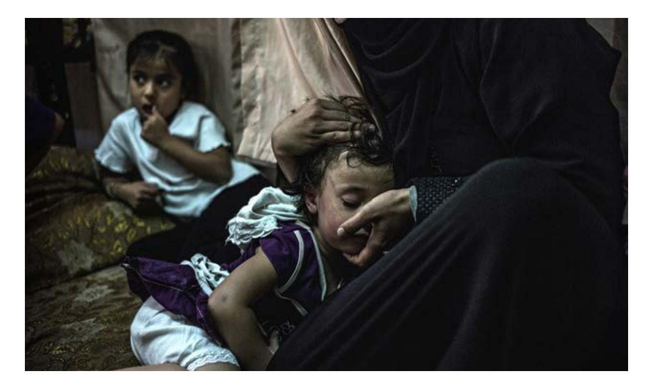
A Syrian refugee mother living in Amman, Jordan, shows the wounds on the face of her young daughter after she was hit by a neighbour.