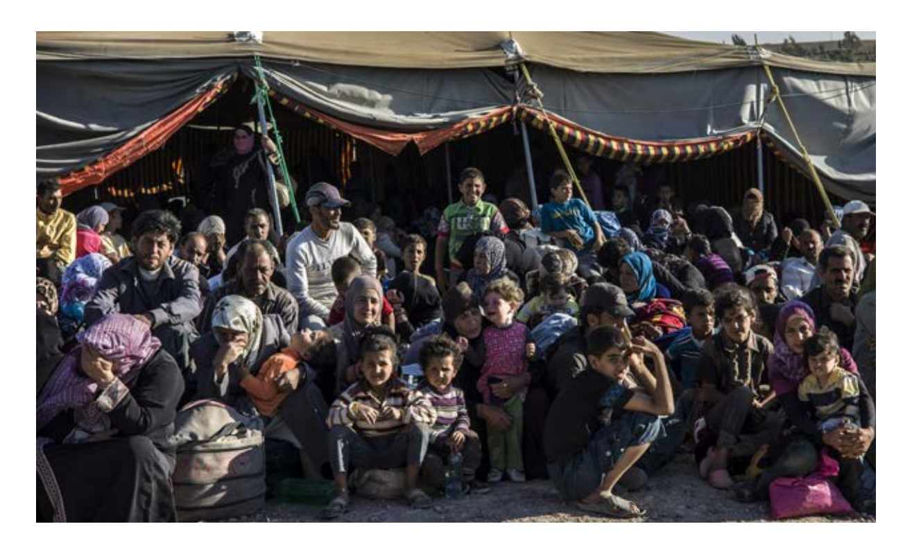
Newly arrived refugees at the Jordan-Syria border await transport to Za'atari refugee camp in Jordan.

UNHCR registration sites in Beirut, Tripoli and Tyre. Some organizations run unique programmes, such as Korea Food for the Hungry International, which offers tae kwon do for children in Za'atari camp.