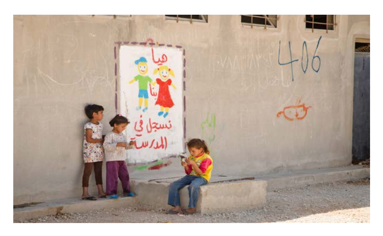
A mural painted by children in Za'atari refugee camp that says "Let's go register for school."

Many children must walk to school. Parents and protective older siblings in both countries described their concerns that pupils—particularly younger children and girls—will be unsafe or get lost. Some therefore keep them at home. Others insist on the importance of education and, though wary about safety, let them walk alone.