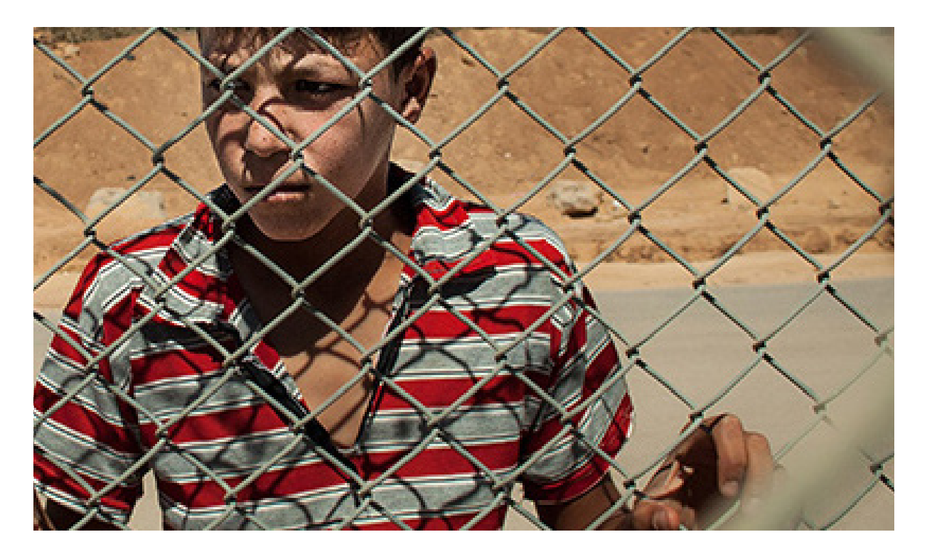
A young boy looking for work in Za'atari refugee camp, Jordan.

in Lebanon, said that "If you go on the street, you see Syrian children working everywhere."