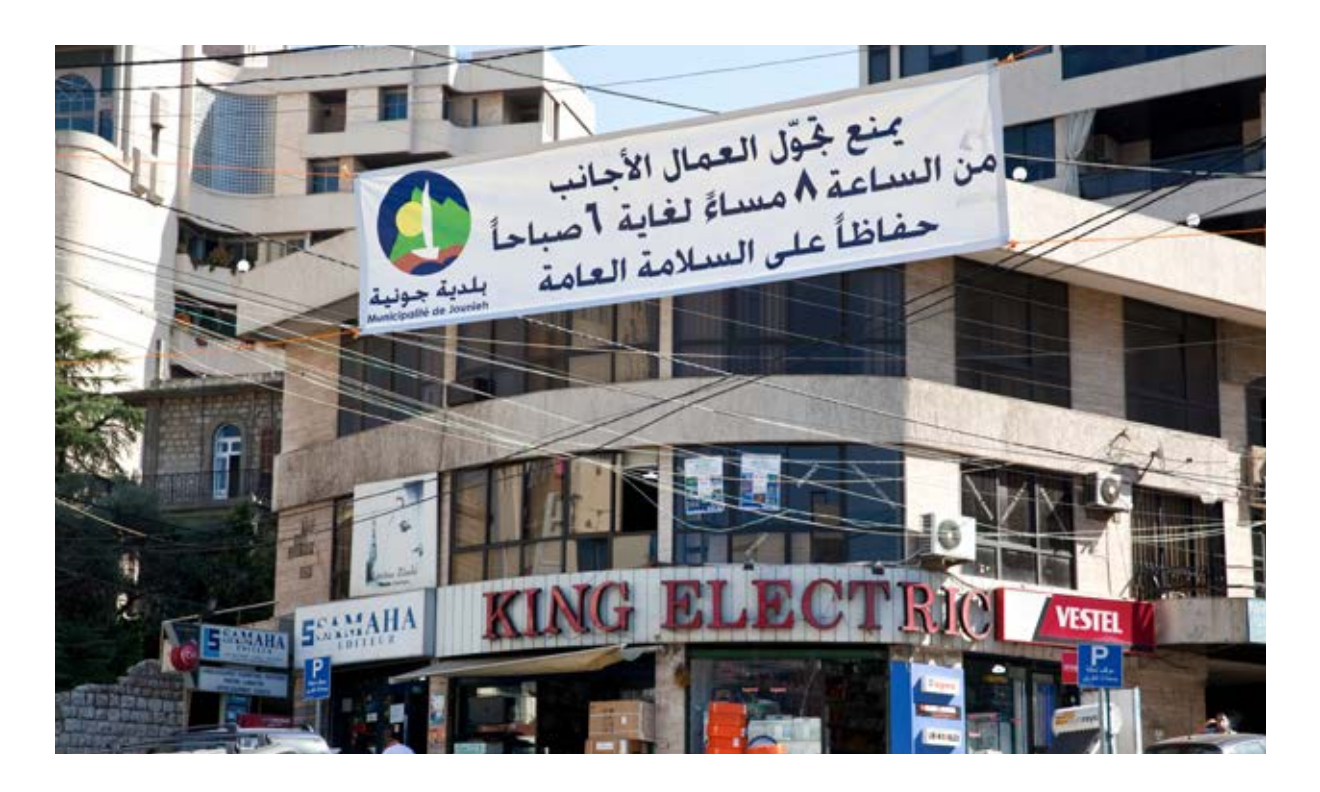
In many areas of Lebanon, curfews are imposed on Syrian refugees. Some refugee children have jobs that do not allow them to return home in time. This sign in a busy street in this suburb of Beirut, Lebanon, reads, "It is forbidden for foreign workers to walk around from 8pm-6am for public safety — Jounieh Municipality."

Syrian children. One community leader said theft by children had increased in the first half of 2013, sometimes instigated by adults. Some boys in Za'atari allegedly belong to gangs, which instill fear in other refugees living in the camp.