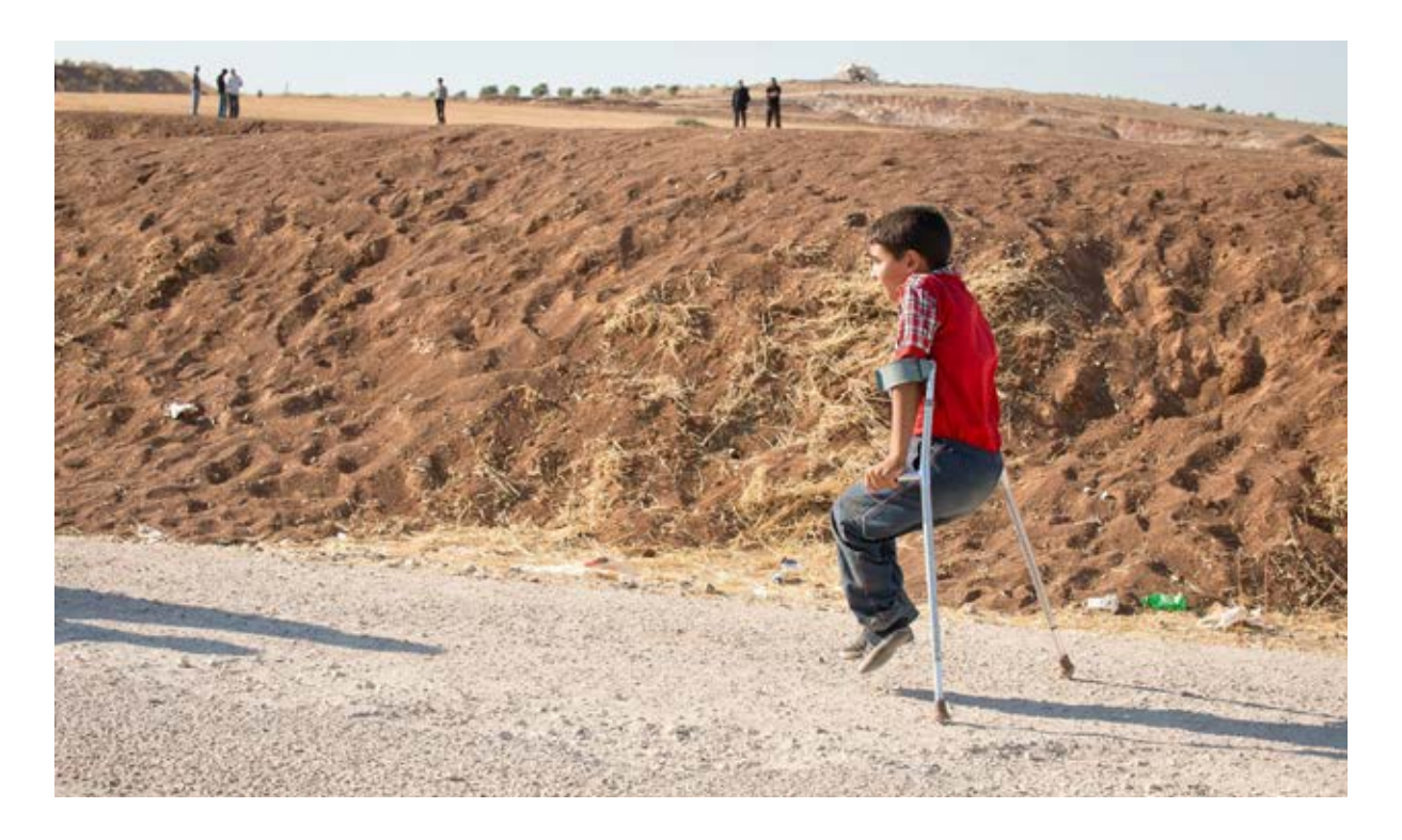
A young Syrian refugee enters Jordan on crutches.

friendly spaces. Children also receive psychosocial support through NGOs and community centres, as well as at UNHCR registration centres.