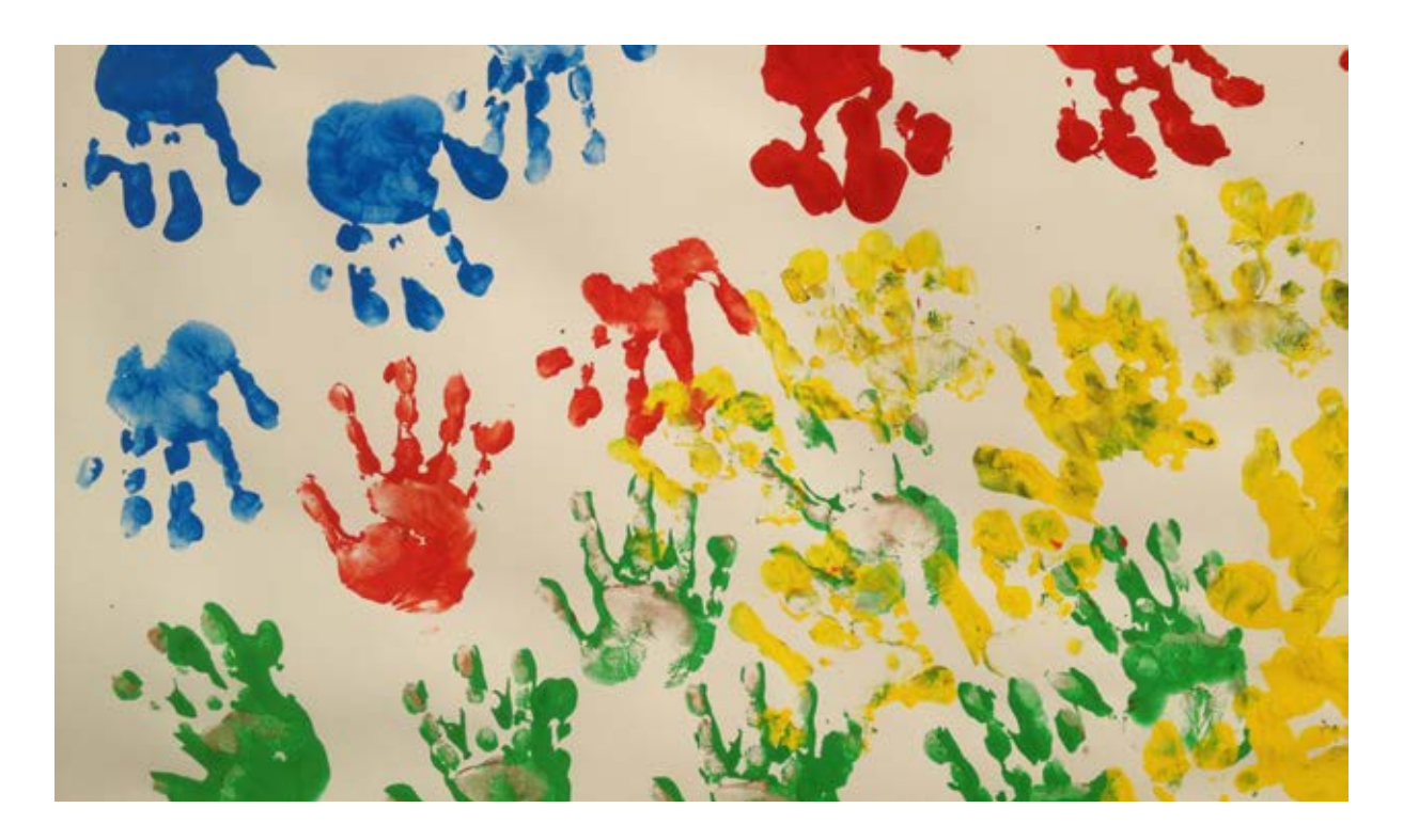
Finger-painting found at the Women's Centre in Tyre, Lebanon.