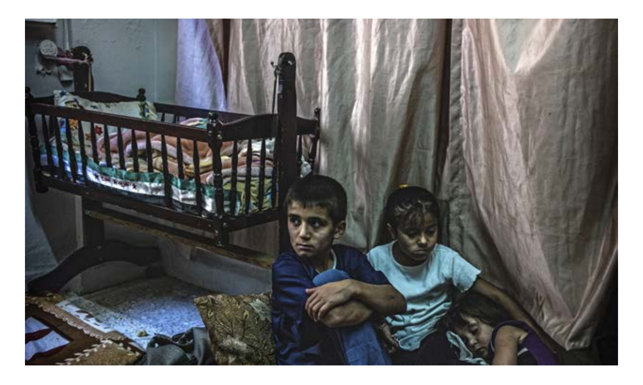
These children live in a tiny apartment in the suburbs of Amman. The television is one of the only sources of entertainment. With family still inside Syria, the parents often follow Syrian channels that show graphic images of violence, destruction and death.

a constant backdrop in Homs—unsettling. He was worried it would start again.