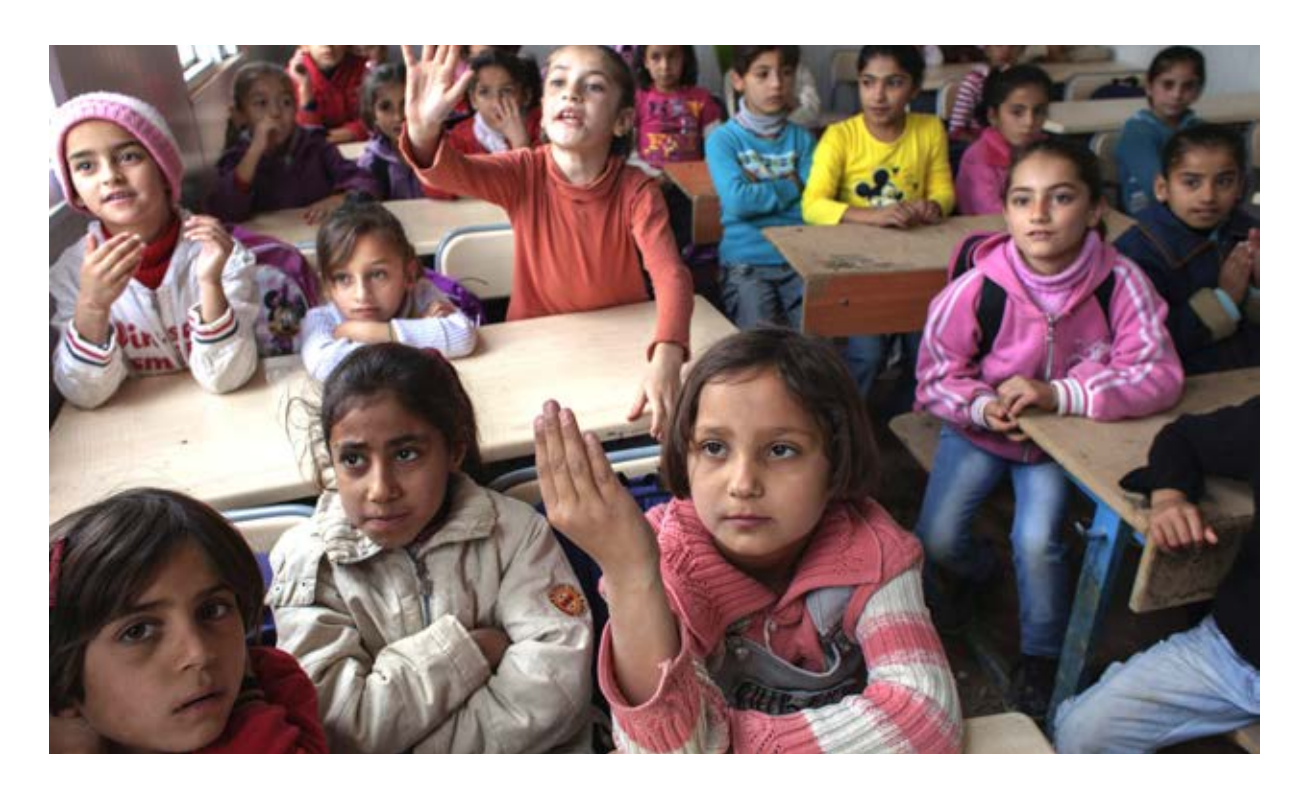
Syrian children attend class at a primary school in Domiz refugee camp in the Kurdistan Region of Iraq. Syrians, even those of Kurdish ancestry, seldom attend public schools in the Kurdistan Region, where the language of instruction is Kurdish, because they are accustomed to attending Arabic-language schools in Syria.

NGO lqra runs a "Classroom in a Bus" in the Bekaa Valley which includes a library, educational supplies and two trained teachers. They run two-hour reading and writing workshops for 14 children at a time, reaching 42 children a day. Language classes are also provided. The teachers also offer training to parents on reading out-loud activities while their children participate in the workshops, which they can carry out with children once the bus leaves.