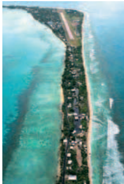
Tuvalu: one of the island nations most threatened by climate change.

If this trend continues, it may just be that by the time the first island state is submerged, its erstwhile inhabitants will find a world more inclined to take the necessary steps to prevent them from being forced into the shadowy global ghetto of the stateless. Arresting climate change will be a Herculean task. But preventing this particular side effect should not be beyond the collective capability of the international community.