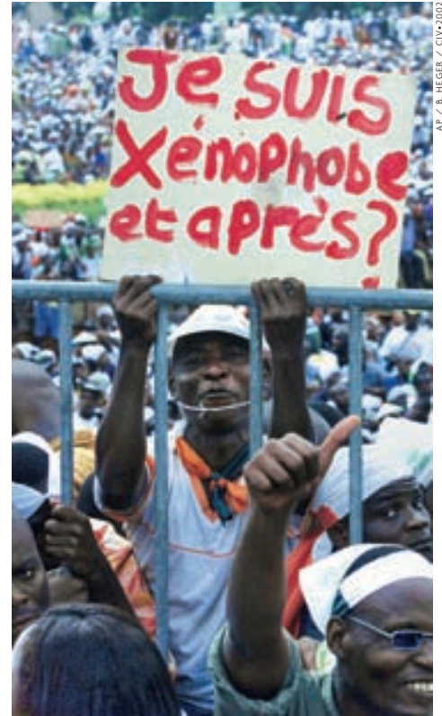
"I am a xenophobe, and so what?" Feelings run high during a 2002 demonstration in Côte d'Ivoire.

IN THE 1990S, A BURGEONING economic crisis led to friction between