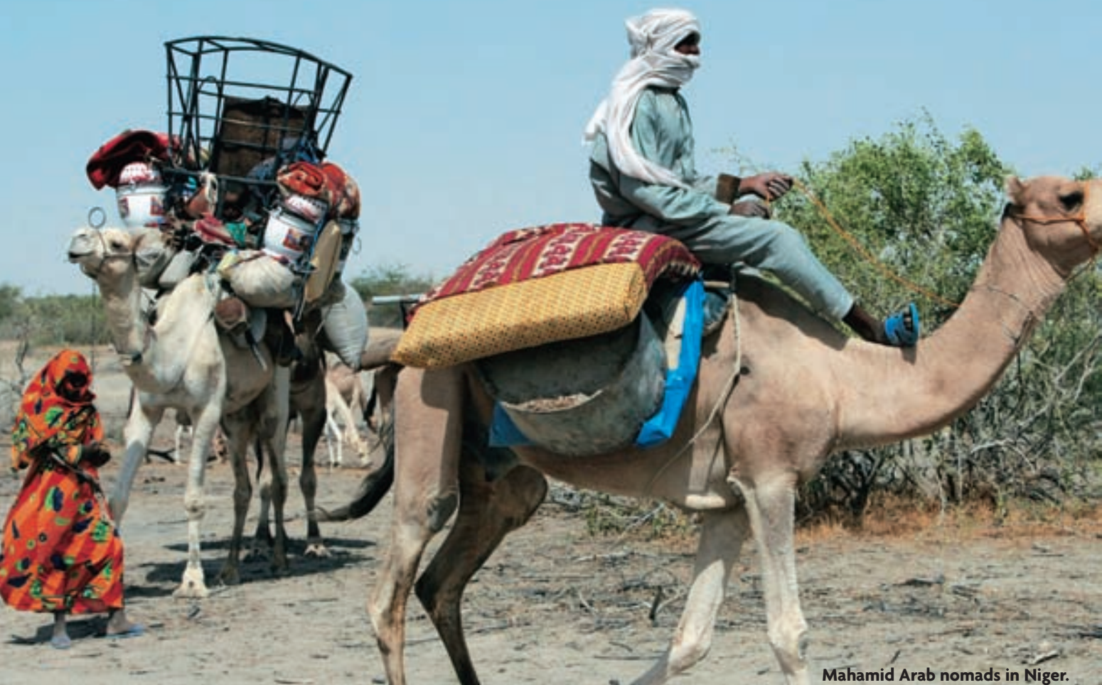
Mahamid Arab nomads in Niger.