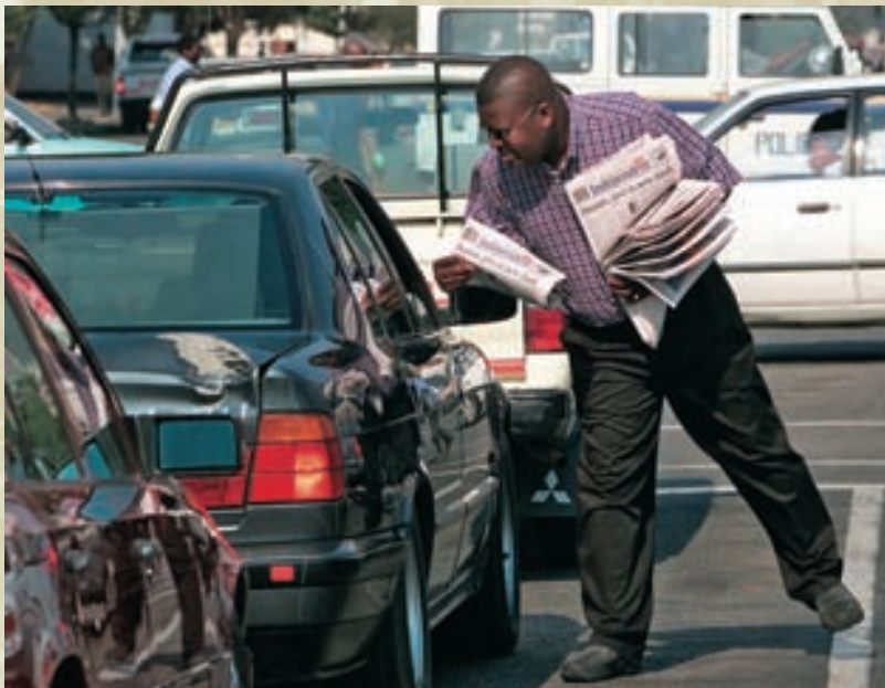
Leading Zimbabwean newspaper publisher Trevor Ncube seeing how his papers fare on the street, after reports that vendors were being harassed.

In colonial times, farm labourers often moved between what is now Zimbabwe and neighbouring countries – especially Zambia, Mozambique and Malawi. All three of those countries now have different laws governing citizenship. Unlike many other states, none of the nations in southern Africa allow people to hold citizenship of more than one country, and in some cases people may lose