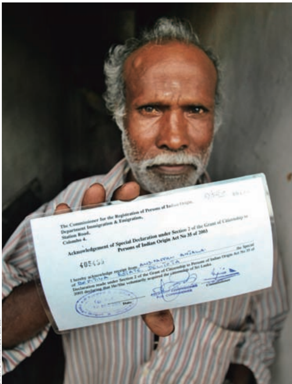
A plantation worker shows the receipt for his wife's citizenship application.