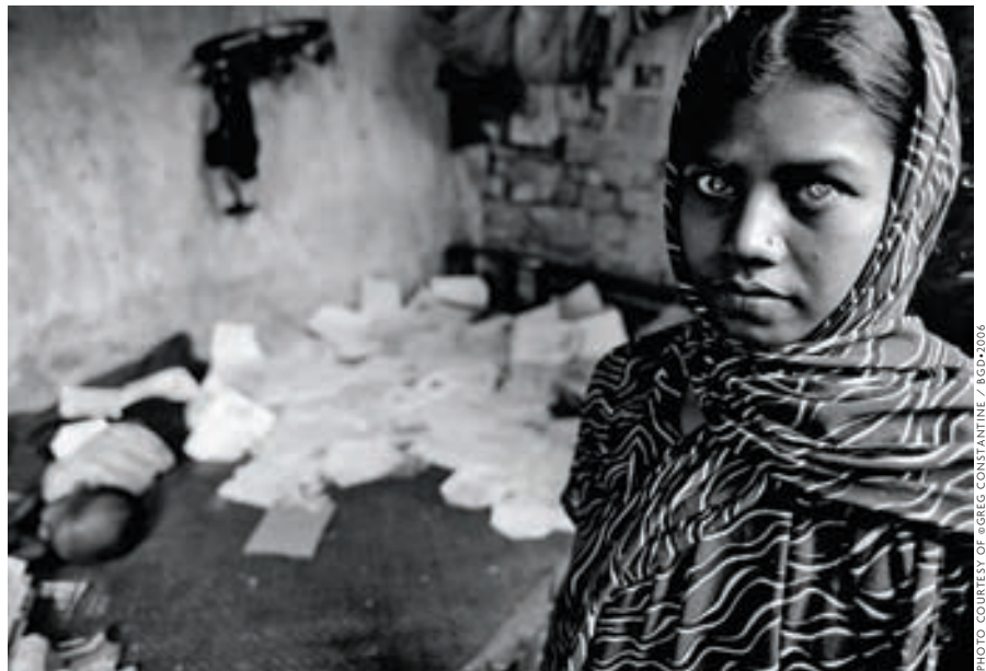
This 20-year-old Bihari mother of a young baby is going blind. She makes paper bags for a living after her husband abandoned her, and has no access to healthcare.

There are, however, still dozens of states in Africa, Asia and the Middle East that retain such discriminatory measures.