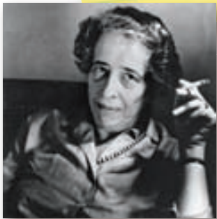
By 1969, Hannah Arendt had become a US citizen.