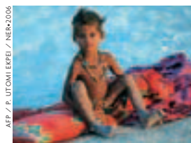
AEP / P. UTOMI EMPEI / NER•2006

20 Naturalization means new opportunities for Sri Lanka's stateless tea-pickers.