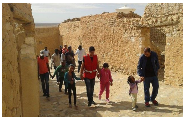
Go-and-see visit organized by UNHCR's partner IRT in Tozeur for 30 refugee children and youth, 29-31 October.