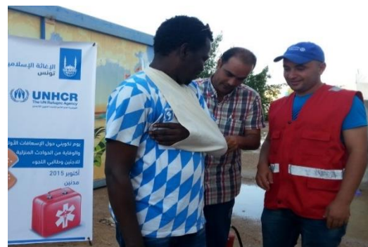
First aid training conducted on 15-16 October for refugees in Medenine.