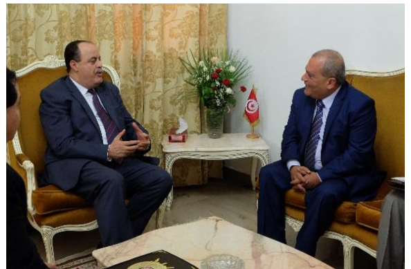
Representative's meeting with H.E Mr Najem Gharsalli, Tunisian Minister of Interior that was held on 8 October, 2015 on the occasion of the donation.