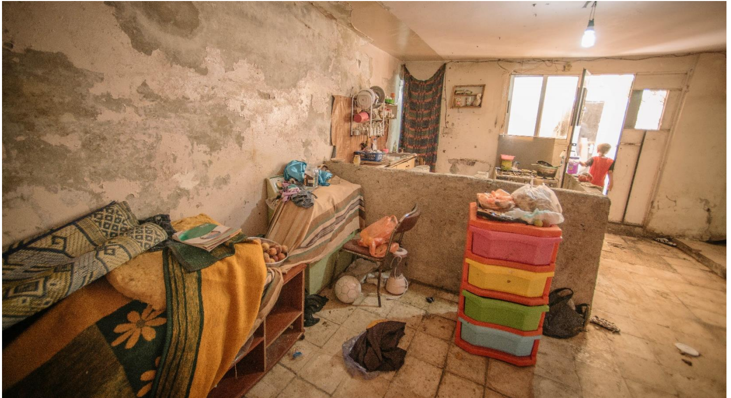
A refugee family's kitchen in Marka, a suburb of Amman.

The World Food Programme announced the resumption in late October of vital food aid to 85 per cent of urban refugees, amounting to some 438,000 individuals, registered with UNHCR in Jordan.