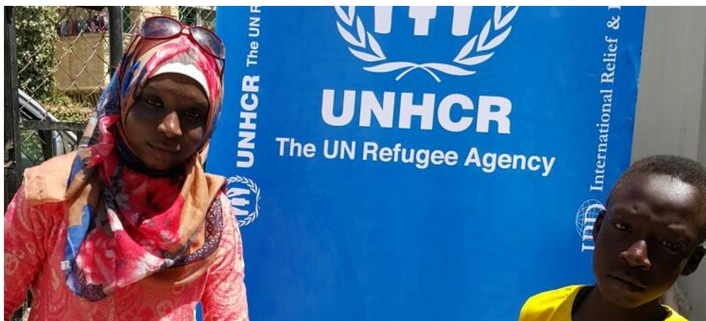
Sudanese students in Amman at the beginning of the new school year in September 2015.

Whilst Jordan's refugee population overwhelmingly originate from Syria (630,176) and Iraq (51,499), other smaller populations, such as those from Somalia (769) and Sudan (3,514), also rely on the critical support of UNHCR and its partners. The majority of Somali and Sudanese refugees live in urban areas in the Amman Governorate with most having fled from violence and unrest in their countries of origin.