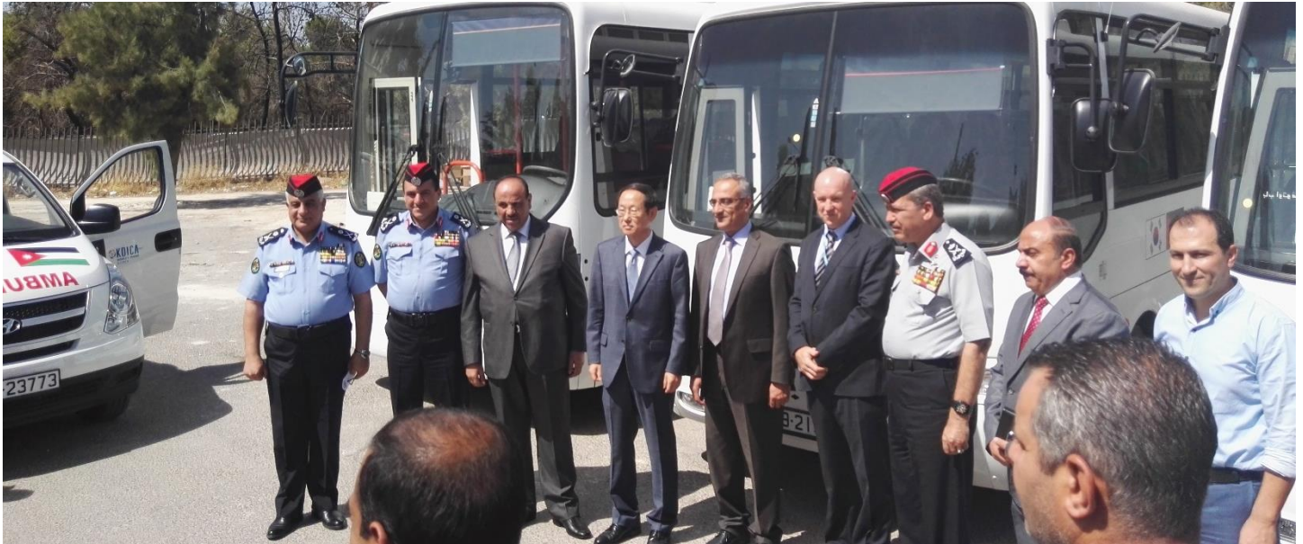
The donation ceremony at the Ministry of the Interior in Amman on 1 October.

The Republic of Korea generously donated six vehicles to the Government of Jordan at a ceremony at the Mol in Amman on 1 October. The three buses for the Mol, and two ambulances and one bus for the Ministry of Health, valuing US $ 417,000, will be used in those areas of the country most affected by the demographic and infrastructural pressures resulting from the influx of refugees into Jordan in recent years.