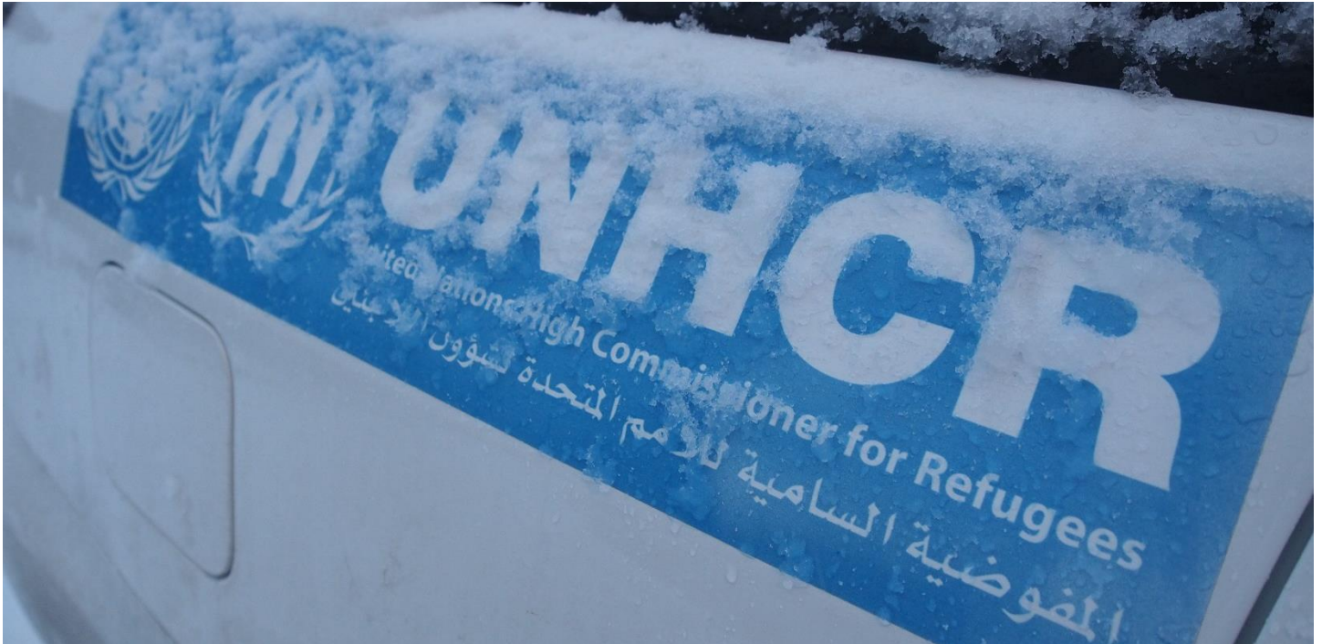
UNHCR's winter support provides a literal lifeline to Jordan's many refugees during the winter months.

UNHCR's winter assistance plan this year seeks to provide support to 229,400 of the most vulnerable refugees across Jordan, representing 37% of the total refugee population. The support will be provided through three key areas: cash assistance, non-food items and shelter support. The total budget for the critical winter support is US $ 18.5 million.