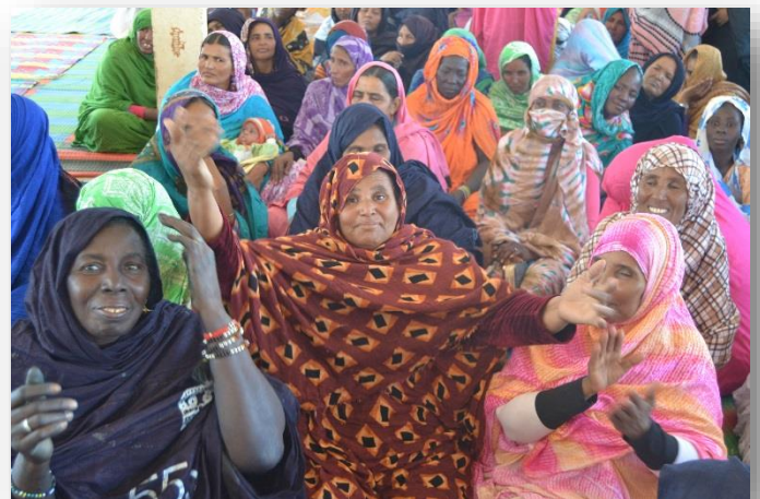
16 Days of Activism campaign Launch in Mberra camp