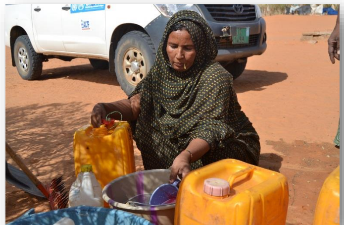
Rinsing jerrycans as part of proper water and hygiene practices in Mberra Camp.