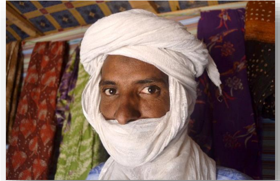
"It is only by acknowledging our weaknesses that we can develop our true strengths" Malian refugee living with disability in Mberra camp.