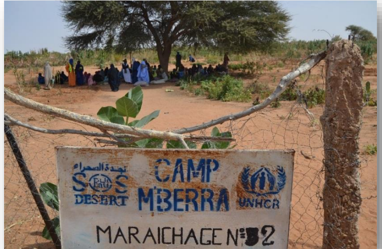
Gardening fields in Mberra Camp.