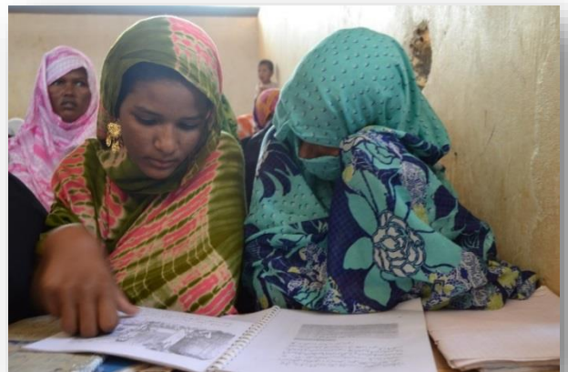
Arabic alphabetization class in Mberra Camp.