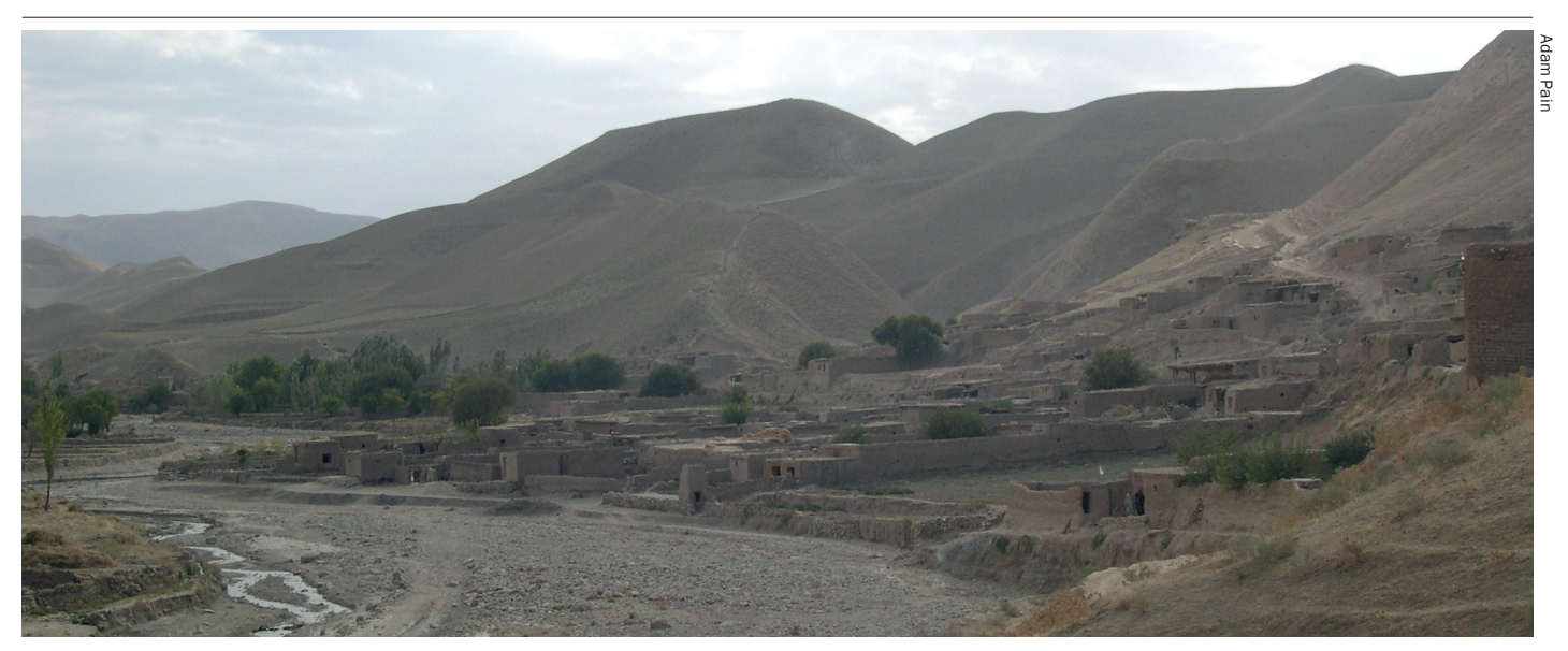
A Saripul village: Given the limited penetration of the outside world into Afghan village life, collective action at the village level continues to play an important part in ensuring the provision of basic services for all

economically secure, often as a result of large landholdings, the incentives to promote social solidarity and widen access to public good provision are likely to be more limited. Here the elite is prone to act more in its own interests than in the interests of the village population at large.