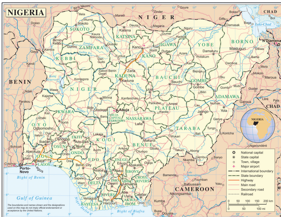
United Nations Map No. 4228 Rev. 1 August 2014 (16) .