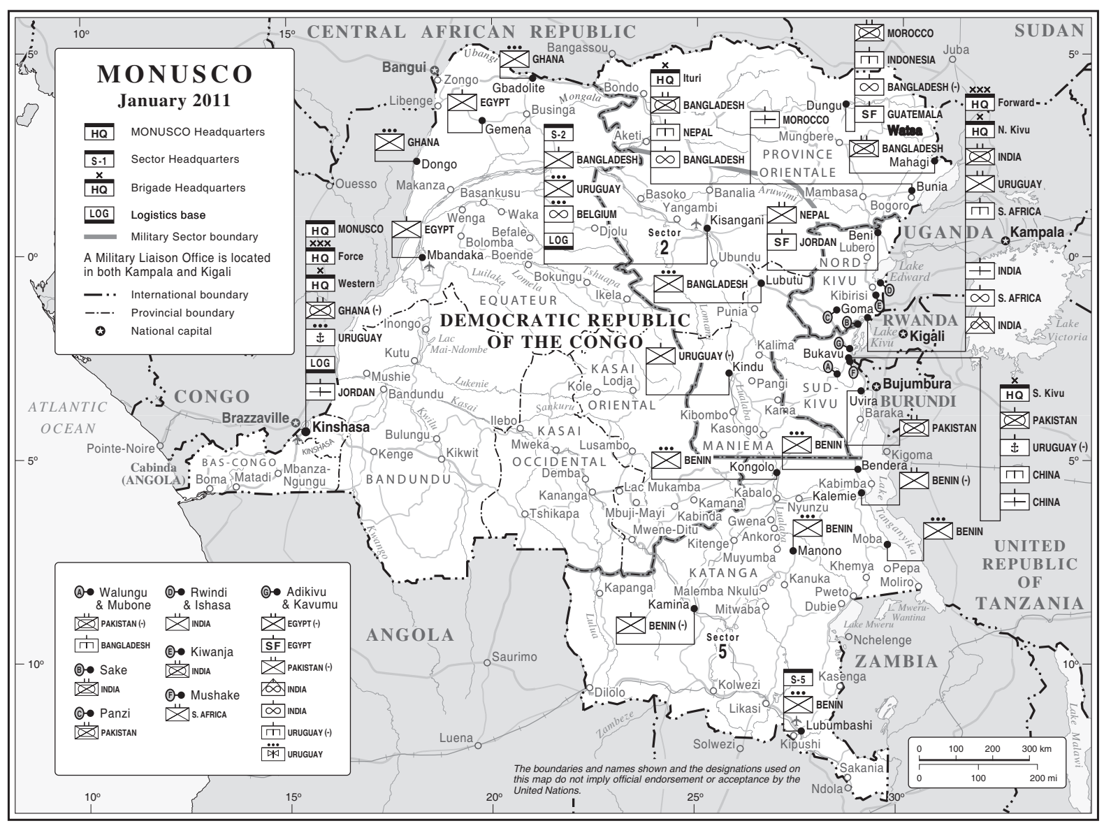
Map No. 4412 Rev. 02 UNITED NATIONS