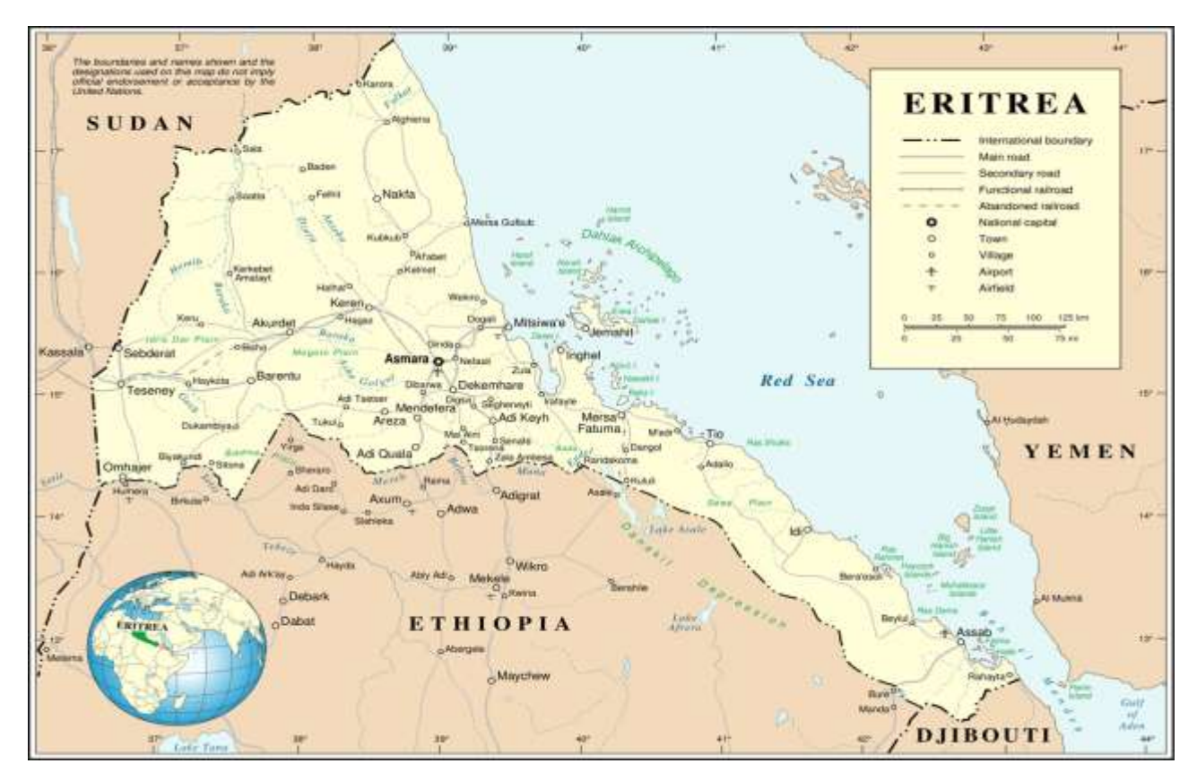
Map of Eritrea.