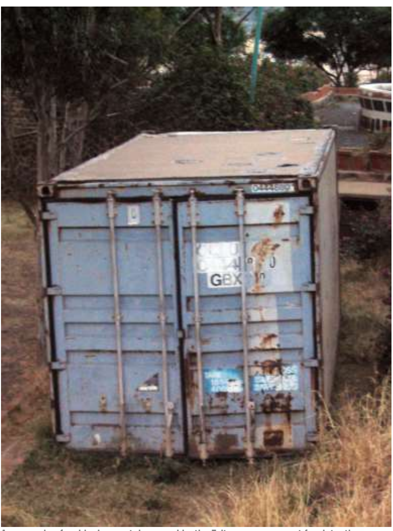
An example of a shipping container used by the Eritrean government for detention

All people deprived of their liberty must be treated with humanity and with respect for the inherent dignity of the human person. <sup>160</sup> This obligation is a fundamental and universally applicable rule, which cannot be dependent on the availability of material resources. <sup>161</sup> International standards set out certain specific requirements for the accommodation of prisoners, in particular with regard to space,