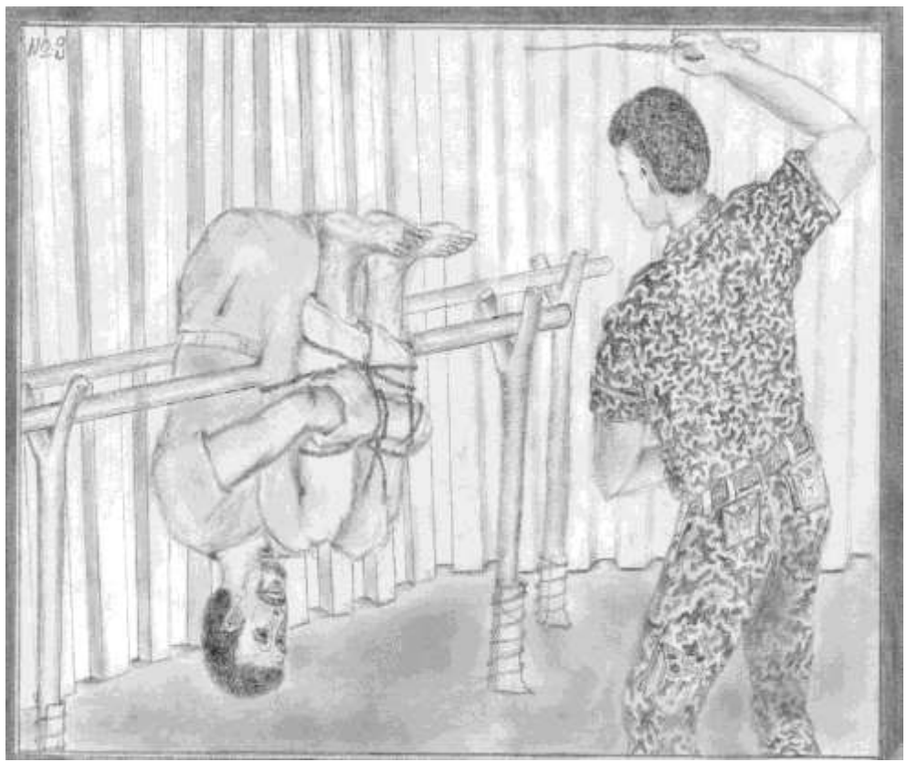
An example of torture technique used by the policeman during interrogation ©Private | FILE photo used in Eritrea: 'You have no risk to ask- Government resists scrutiny of Human rights.' (2004)

"The interrogation was to know why the person was trying to cross, how they organised it, how many people were involved in the attempt. If people were crossing together, we would interrogate them until their accounts were in agreement. Sometimes we would use torture to extract the information. We used a method where you tie the arms around the ankles and place a pole under the knees and over the elbows. We would then suspend the person upside down, and beat [them] on the soles of the[ir] feet."