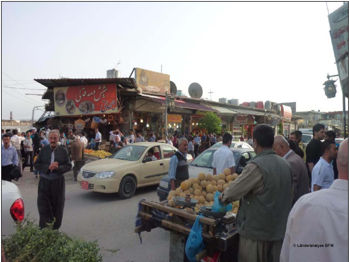
Market in Sulaymaniya, May 2011.