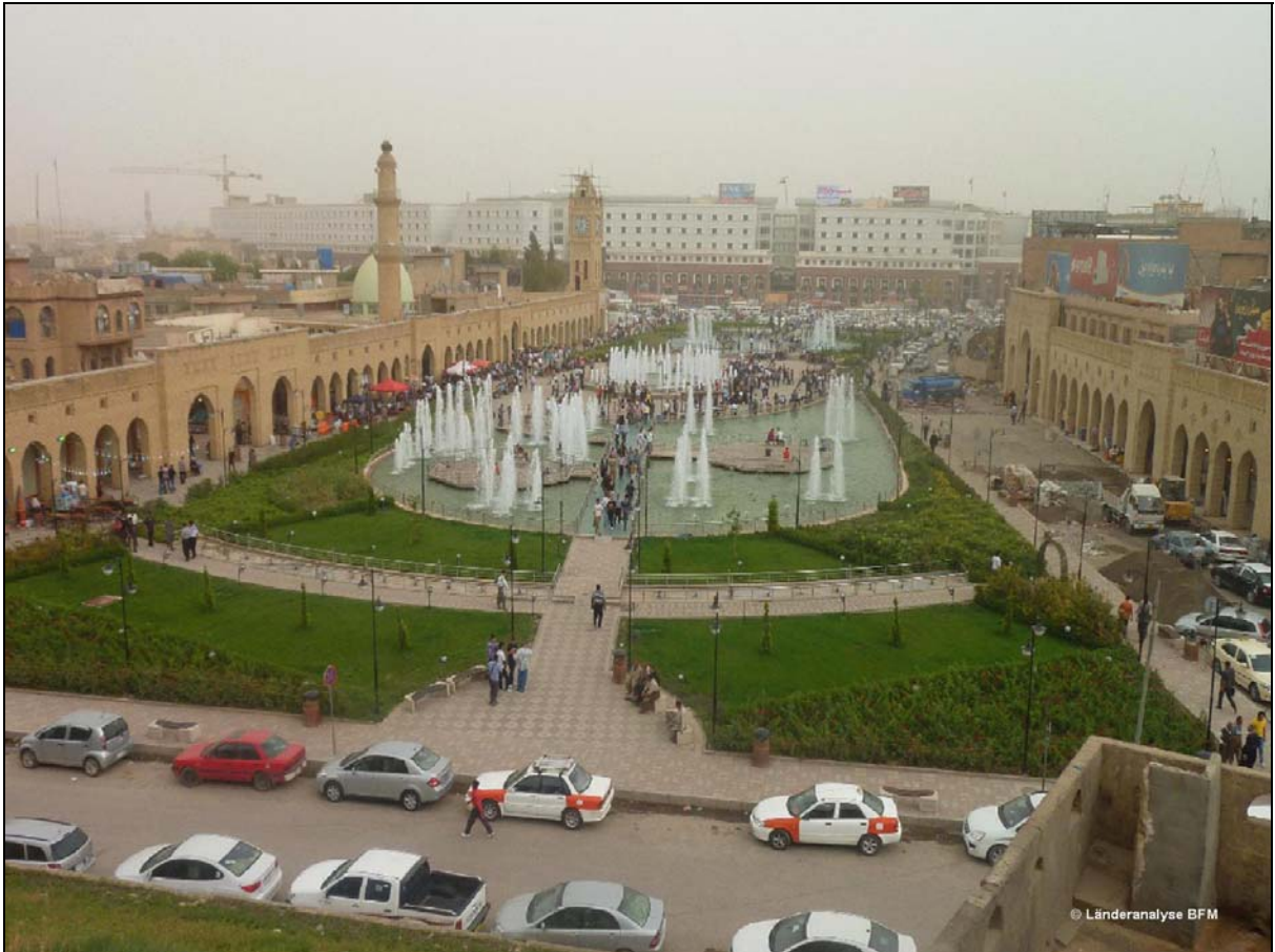
The white building in the background is a large mall in Erbil.

The KRG welcomes foreign investments. For example two Carrefour supermarkets will be opened soon, one in Erbil and another in Sulaymaniya.