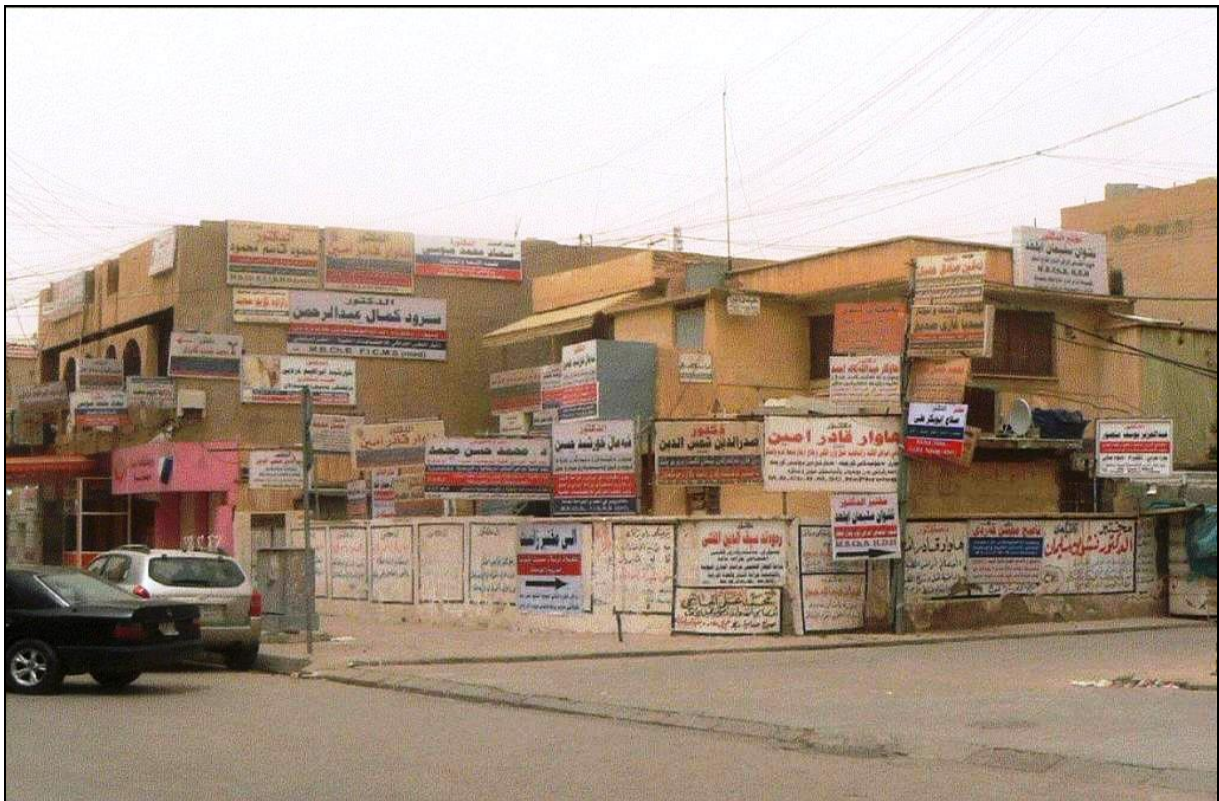
Area with private health care practices in Erbil city, May 2011. In the KRG area, some 10%-15% of health care services are performed by private hospitals and health centers. 420

Another problem in convincing health care professionals to return to Iraq is that salaries are not very competitive. Junior doctors and senior pharmacists receive a monthly salary of about $1000; senior doctors and specialists earn about $2000-$3000 per month. Salaries for health care staff are higher in Jordan. In Iraq, doctors have private practices in addition to their work in the public sector to compensate for the low salaries. Salaries in the private sector are easily double or triple those of the public sector. Thus, many kinds of private health care are available in Iraq. However, according to Iraqi authorities, most private medical centers do not meet the quality standards of the Iraqi government. 419 The fact-finding mission heard that a visit to a private practice generally costs $10-$20 per patient.