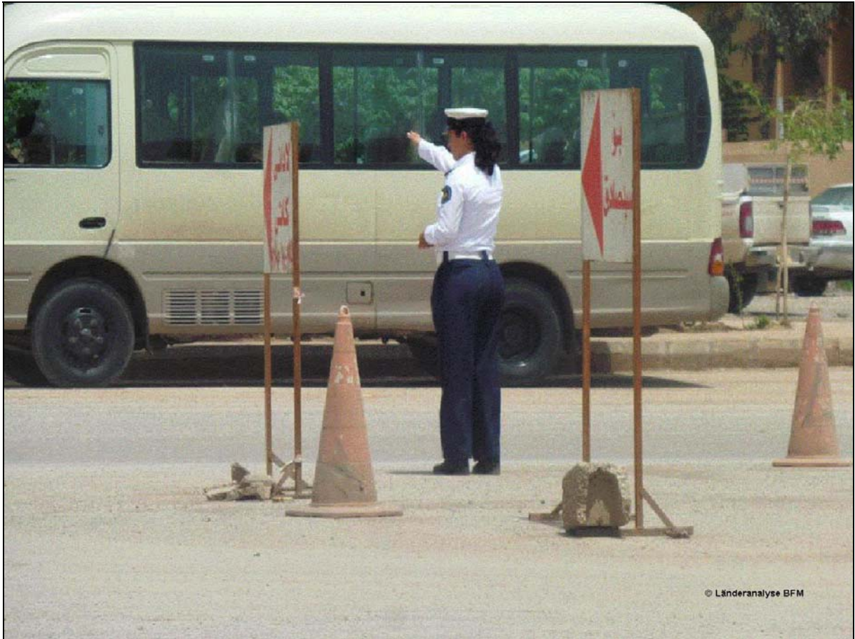
A traffic police officer near Sulaymaniya.

KRG authorities have acknowledged that the skills of the security forces need to be improved and have welcomed new training projects. For instance, the EU trains KRG police forces in riot control and how to deal with demonstrations and abuse against women. Some states also have bilateral training of the police. 95