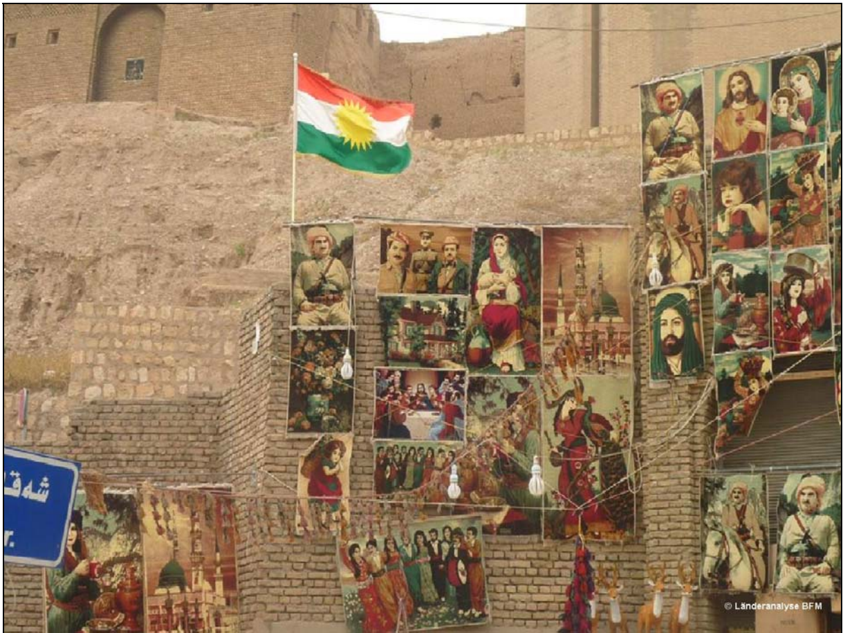
A mosaic in the KRG area: various ethnic and religious figures on carpets below Erbil Citadel (Kurdish leaders, Christian Saints and the Last Supper, Shiite imams, and so forth)