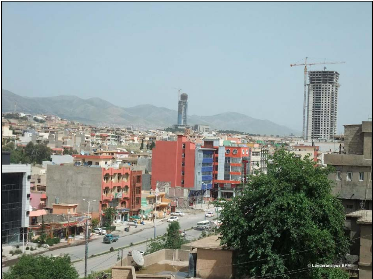
New skyscrapers under construction in Sulaymaniya.

Despite a veritable construction boom, in many ways the economy of the KRG region remains unsustainable and unproductive. There is almost no industrial activity or productive factories. Sources told the fact-finding mission that almost everything is imported 73 these days, even tomatoes. 74 The range of goods is satisfactory, but it is not easy to find Iraqi products in the KRG region. There are essentially no modern dairy farms in the area, although before the fact-finding mission, the KRG had promised to give loans of 100 million Iraqi dinars ($84,000) to farmers who sought to build a dairy farm. 75 Agriculture in the KRG region was widely destroyed during the Anfal operations and Saddam Hussein's rule in general and is largely neglected today, despite the obviously fertile land.