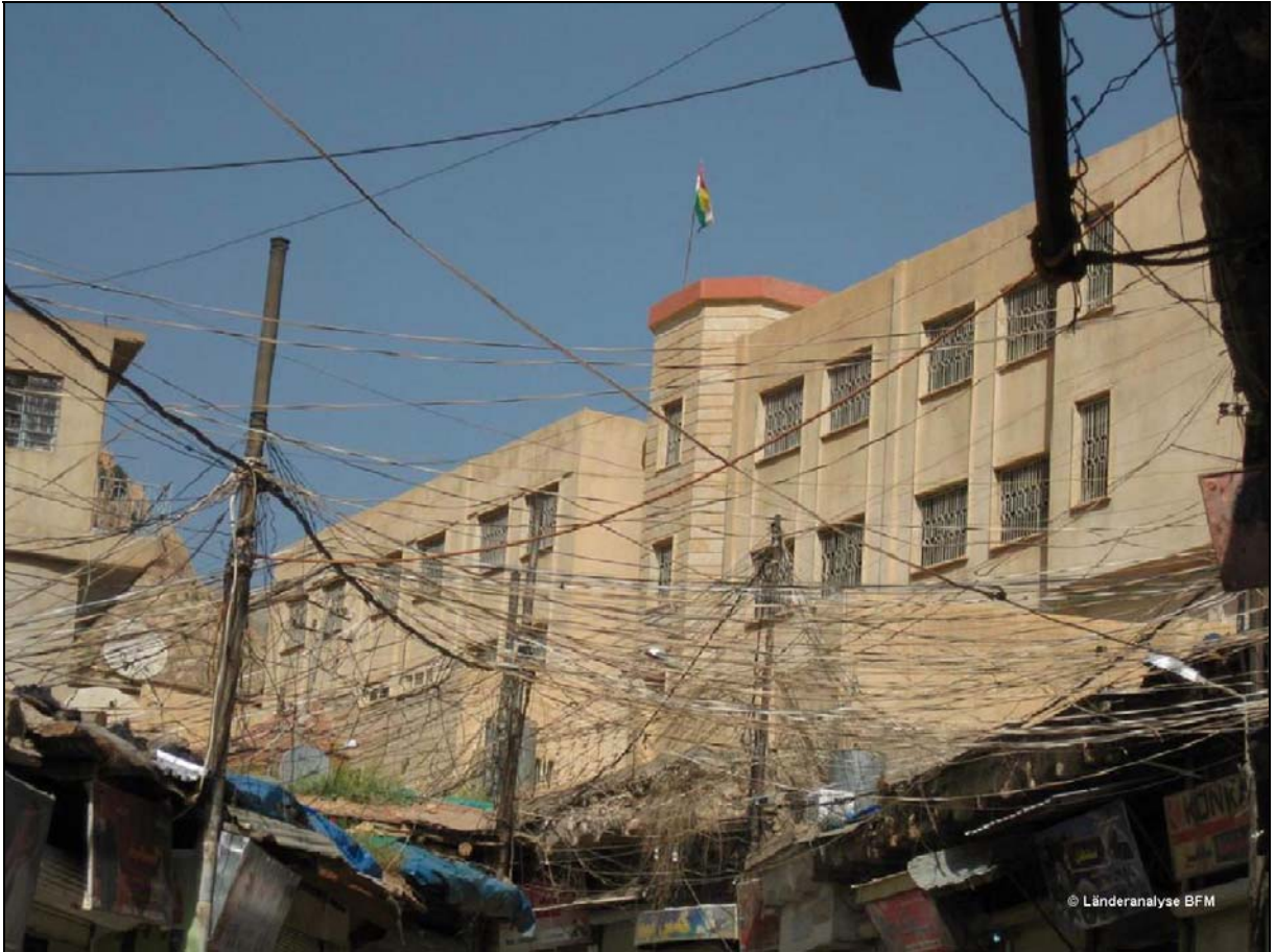
Electricity net in Akre.