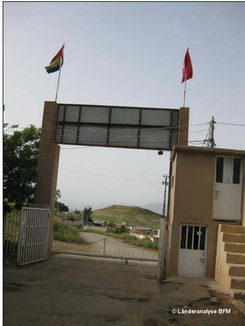
Komala Camp in Zergwez – The entry gate was guarded by a female Peshmerga.

that this had not occurred in recent years. Until two or three years ago, Komala representatives left the camp only in guarded vehicles because of the kidnappings. Komala Camp still has rather strict security measures at the entry gate.