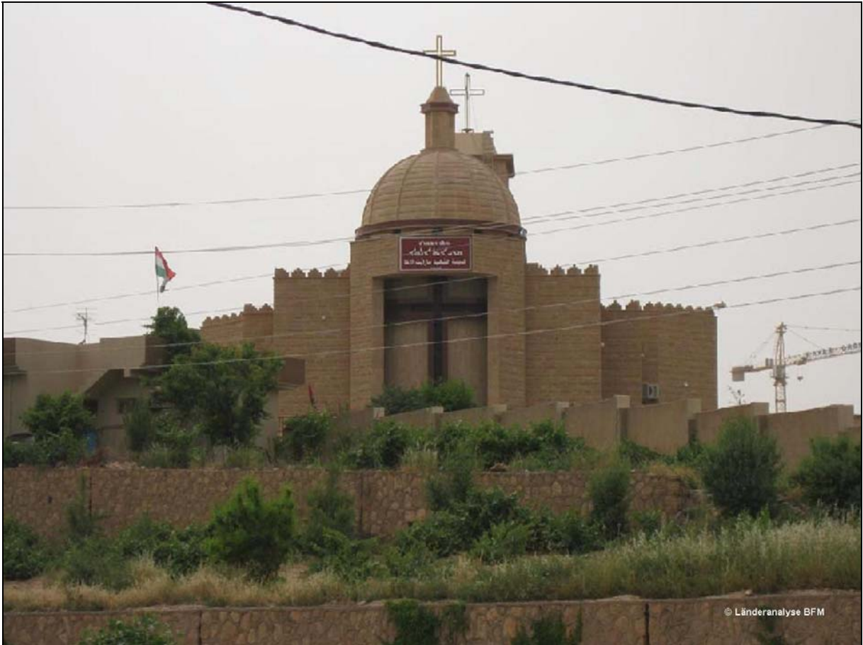
An Assyrian Church in Dohuk.

Church 197 ; the Assyrian Church of the East, or Nestorian Church; and the Assyrian Evangelical Church), the West Syrian churches (including the Syrian Orthodox and Syrian Catholic churches), the Melkite Church (Greek Orthodox and Greek Catholics), the Armenian Church (Armenian Apostolic and Armenian Orthodox), and the Occidental Christians (Roman Catholics, Anglicans, Presbyterians, Pentecostals, Adventists, and Evangelicals). 198 According to a Danish report, there are about 50 Christian churches of various denominations throughout the KRG region. 199