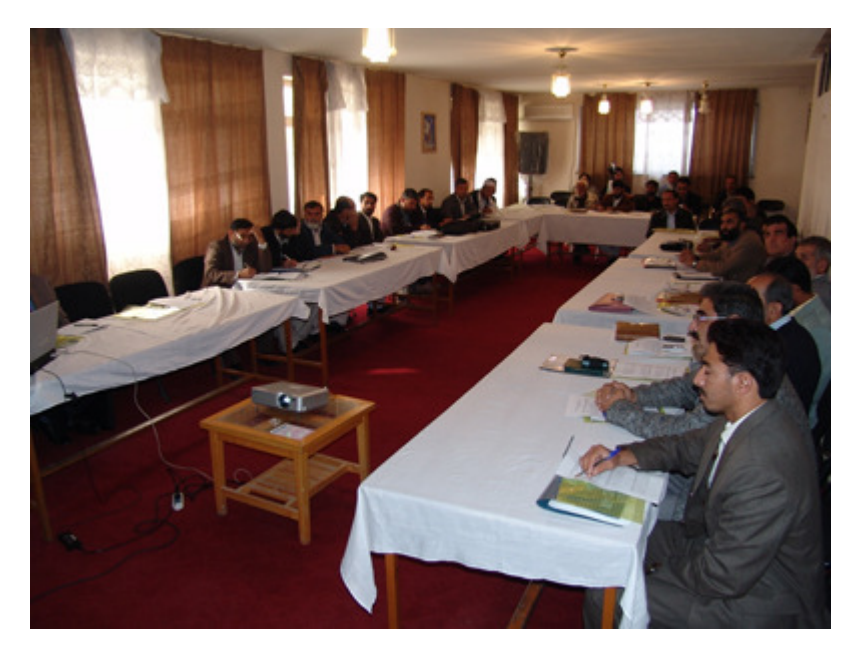
Workshop on Human Rights for advisers to governors of Afghanistan, Kabul, November 2006

Child and AIHRC duties and responsibilities, the tradition of Bad^1 from the prospective of Islam, torture, and the International Day on the Elimination of Violence Against Women.