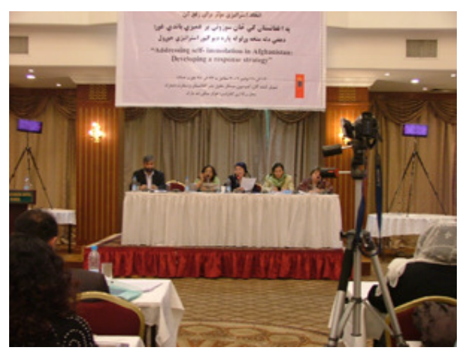
AIHRC International Conference on Tolerance, Selfimmolations and How to Set up an Effective Strategy to Stop Self-Immolation Incidents, 14 - 16 November 2006, Kabul.

The objective of the conference was to discuss and exchange experiences with similar countries in relation with cases of self-immolations. The conference was enriched by the participation of representatives from India, Tajikistan, Uzbekistan, Iraq, Sri Lanka, Bangladesh, as well as representatives from Afghan Civil Society Organizations, the Ministry of Justice, Members of Parliament, and the Ministry of Information, Culture and Youth. At the end of the conference, a committee formed by AIHRC, Afghan civil society organizations, the Ministry of Justice, members of the Parliament 's Statute Committee, and the Ministry of Information, Culture and Youth, was established to develop a strategy to counter the phenomenon of self-immolation in Afghanistan.