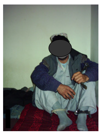
Chains are still used by the police on detainees, Bagram district detention centre, October 2006

In addition, the unit submitted recommendations to the Ministry of Justice in relation with the construction of prison buildings in Kapisa, Wardak, Panshir and Logar provinces. The Ministry of Justice officially informed the Commission that its recommendations were approved, and land was allocated to build prisons in Wardak, Kapisa, Panshir and Mazar-i-Sharif provinces in December 2006.