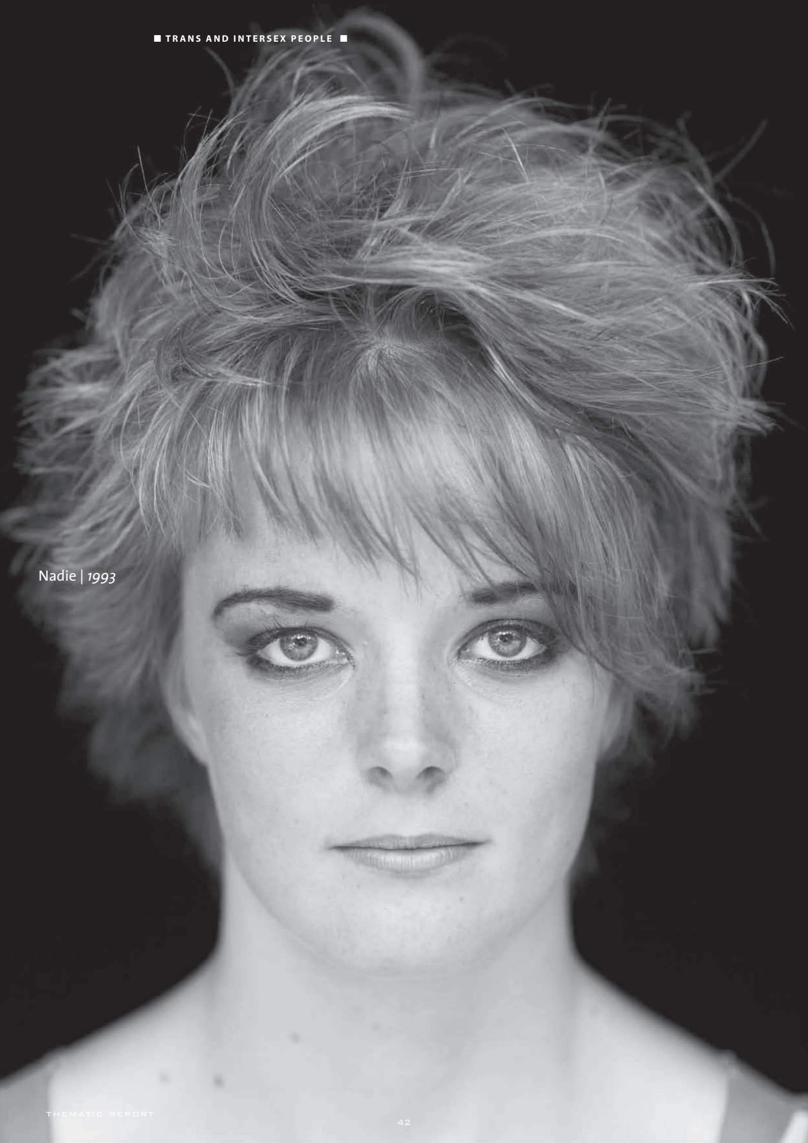
Nadie | 1993