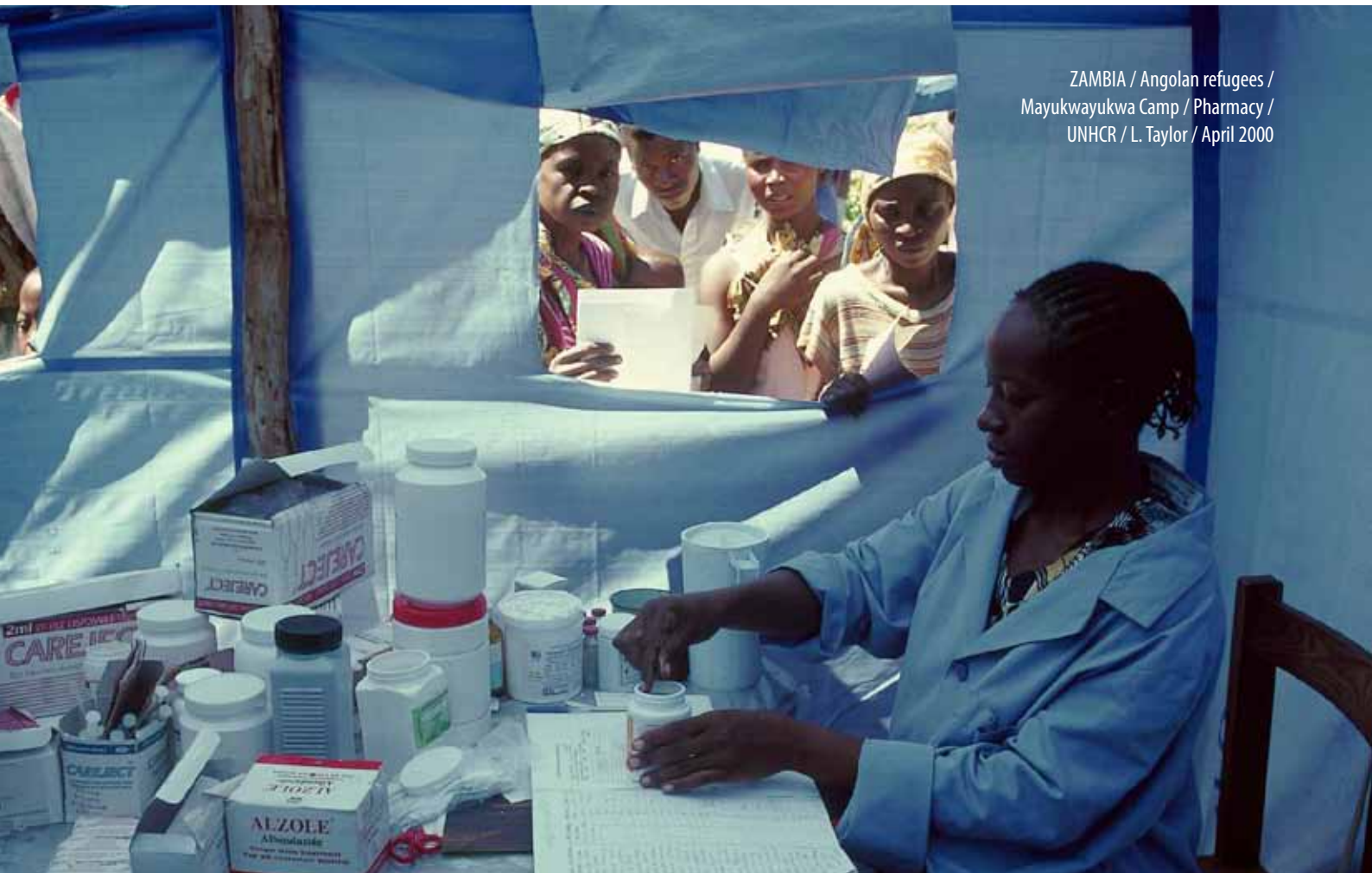
ZAMBIA / Angolan refugees / Mayukwayukwa Camp / Pharmacy / April 2000

Price indication in US$ of each item in UNHCR's EML is available in the newly updated list, so that it can be used to estimate the annual medicine and medical supply budget.