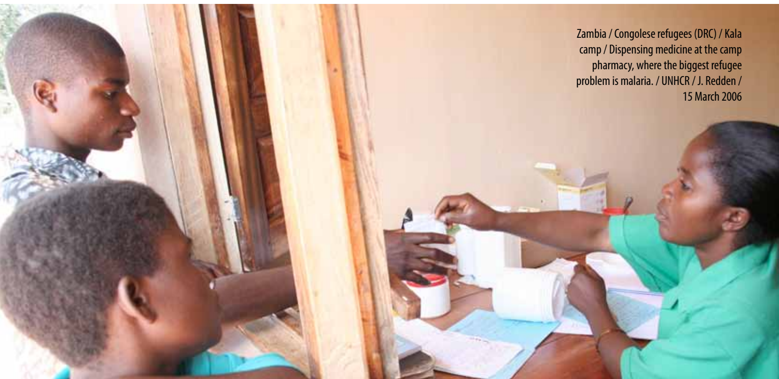
Zambia / Congolese refugees (DRC) / Kala camp / Dispensing medicine at the camp pharmacy, where the biggest refugee problem is malaria. / UNHCR / J. Redden / 15 March 2006

This is particularly important in countries that do not have internationally cleared pharmaceutical companies in country to avoid counterfeit medicines that have flooded many countries.