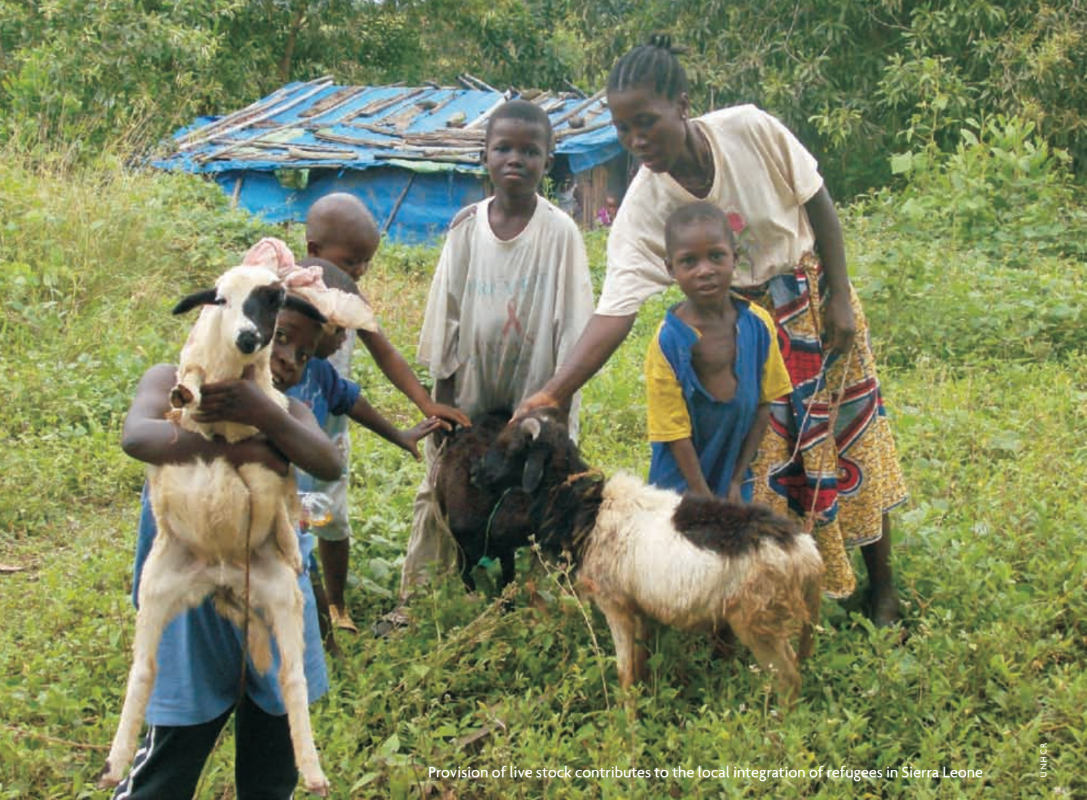
Provision of live stock contributes to the local integration of refugees in Sierra Leone