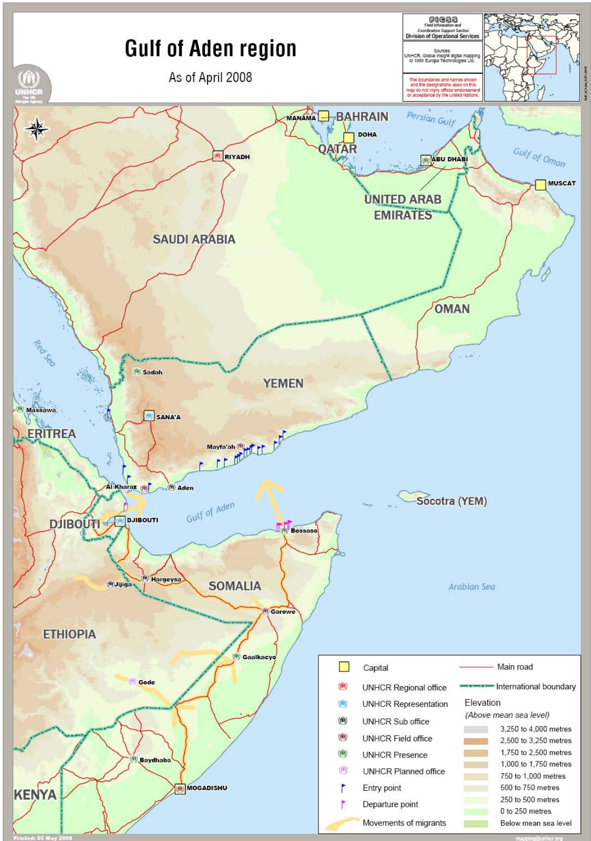
Map 1: International Migration in the Gulf of Aden