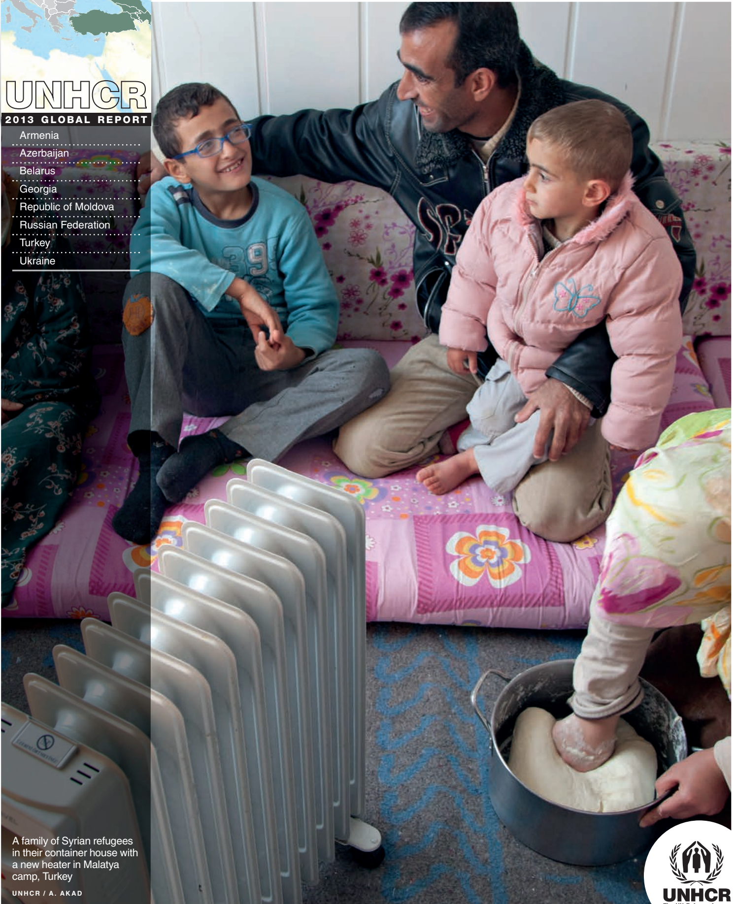
A family of Syrian refugees in their container house with a new heater in Malatya camp, Turkey