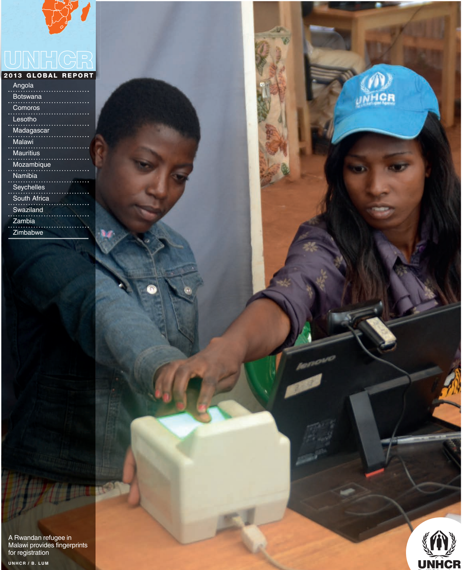
A Rwandan refugee in Malawi provides fingerprints for registration