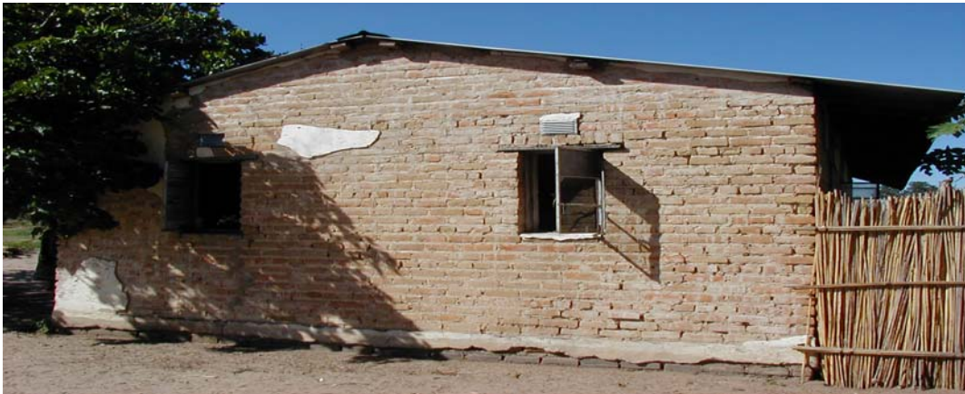
A teacher's house in Ngundi in a deplorable state, before Zambia Initiative intervention.