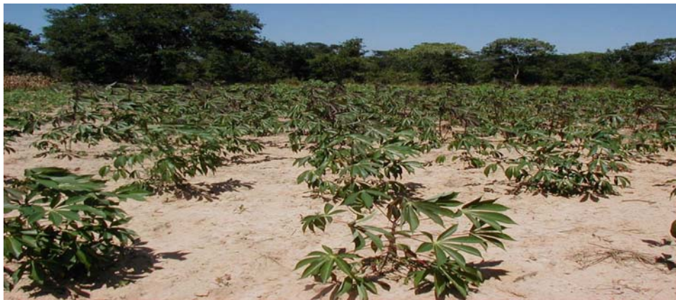
Cassava Demonstration plot in Mayukwayukwa, chief Mufaya area. ZI project introducing new varieties of cassava cuttings that mature early.