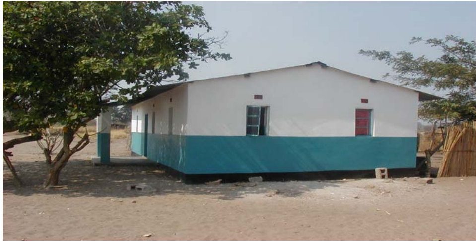
The rehabilitated teacher's house at Ngundi Basic School in Senanga district. This is a Danish funded project.