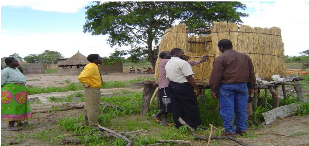
A traditional silo in Mushwala before the intervention of the Zambia Initiative.