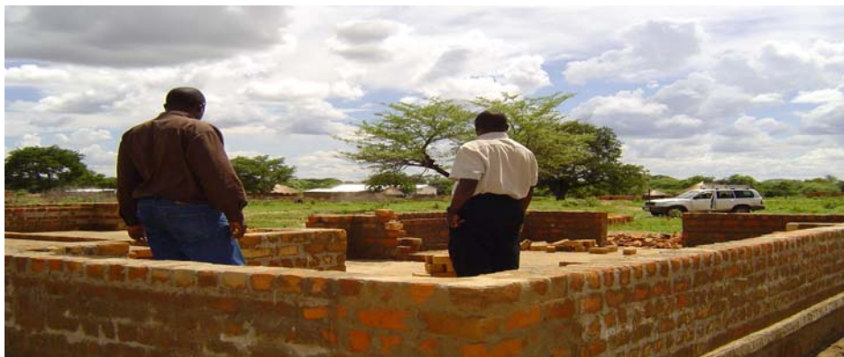
Health Post Construction in Ngundi has gone above window level. Work is currently progressing steadily.