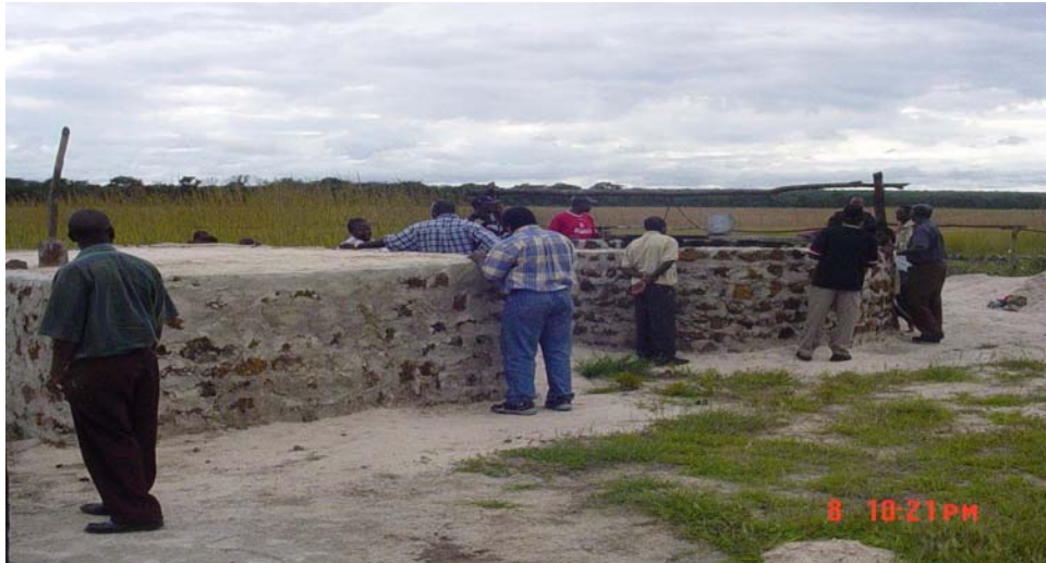
Construction of Communal Hand-dug wells

The picture above shows one of the demonstration hand dug wells under construction in one of the fields in Nkenga, plus an embankment raised for construction of a reservoir on top.