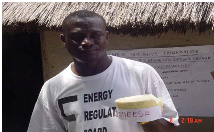
The ZI has also embarked on dairy processing using simple traditional techniques. Above is an Agriculture Officer providing training to local farmers in Lui-Wanyau in Senanga on how to process cheese and other dairy products.