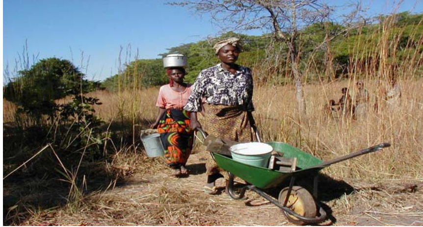
Women above seen engaged in clay brick moulding in Mayukwayukwa