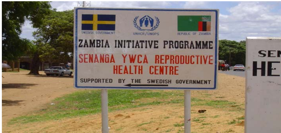
Above, is a sign post at the site where the centre is under construction. Once completed, it will assist in providing skills training in various vocations, including handling reproductive health counselling issues.