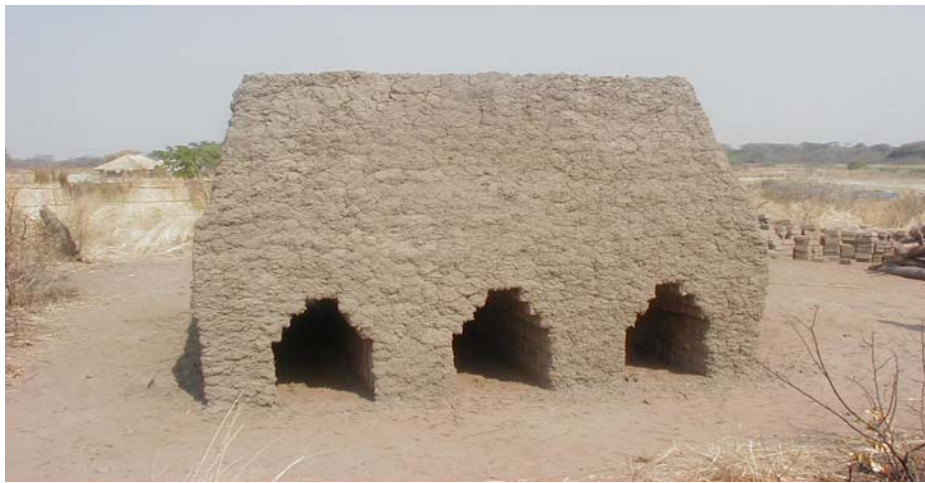
Above is a Kiln prepared in readiness for buring of bricks in Mayukwayukwa.

The ZI program has been engaging LDC's and local villagers/refugees in moulding clay bricks used for construction of schools and health centres.