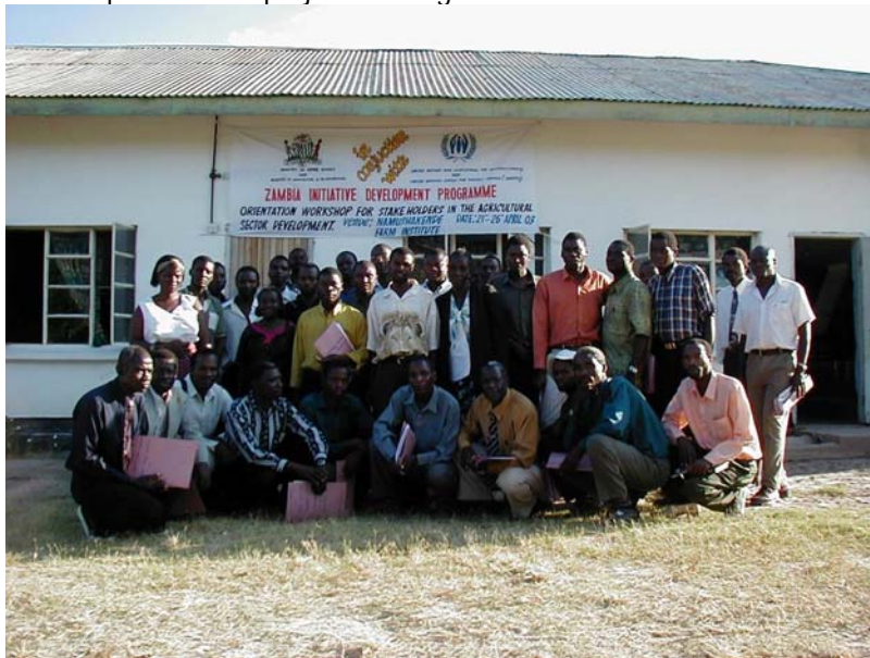
The picture shows a group photo of LDCs and GRZ agric. Camp Extension officers during the Orientation workshop for agriculture development stakeholders conducted in Mongu, at Namushakende farm institute in April 2003.

Some LDCs registered as co-operative societies received training in readiness of introduction of a community managed rural credit scheme and revolving fund. The project is funded under US contribution. In the context of capacity building, three District Agricultural Officers were sent on Agricultural Development training in Japan. This was done in October to December 2002 under the sponsorship of JICA. A series of workshops have been planned to ensure LDCs are trained and able to manage and implement the project at the grassroots.