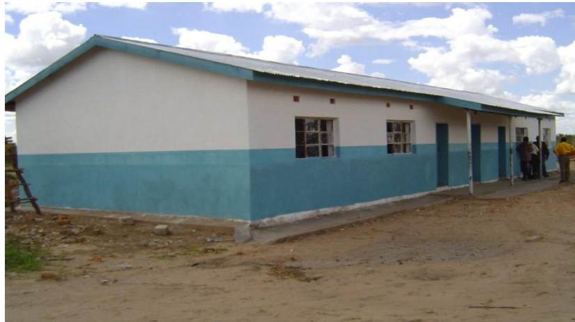
This is a newly constructed classroom block at Ngundi, currently being used by students