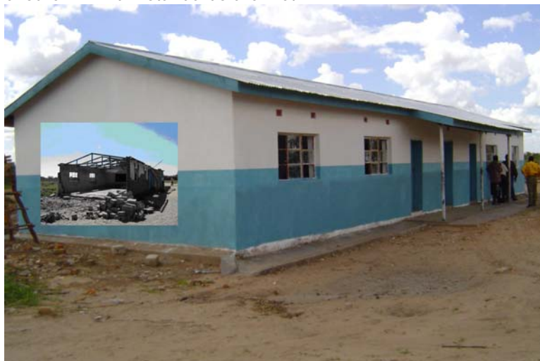
Above, a 1x2-classroom blocks that has undergone rehabilitation at Ngundi Middle basic school. The insert in the above picture depicts the dilapidated building before ZI. Teachers' houses rehabilitation has been completed. The project is funded under Danish embassy small grant contribution to the ZI.

In addition to the substantive three-year contribution made by the Government of Denmark to the ZI (US$10.5 million), as indicated in the table of contribution above. The Royal Danish embassy in Lusaka also contributed to the development of the refugee hosting areas through some small grant at the disposal of the embassy towards rehabilitation and construction of two schools in Mushwala (Lyamunale basic in Kaoma) and Ngundi basic school in Senanga district. The funds were donated through the ZI to the two Local development committees (LDCs) of Mushwala and Ngundi who have been charged with direct execution of the project. The GRZ technical experts offer technical backstopping to ensure minimum standards are met.