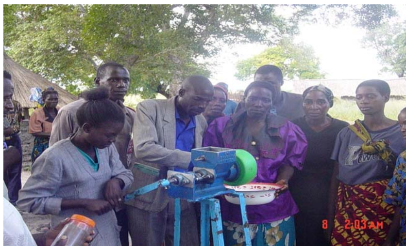
Members of the LDC in Lui-Wanyau in Senanga District demonstrating on how to use a hand-oil-making machine. The machine is used for peanut butter processing and also for extracting cooking oil.