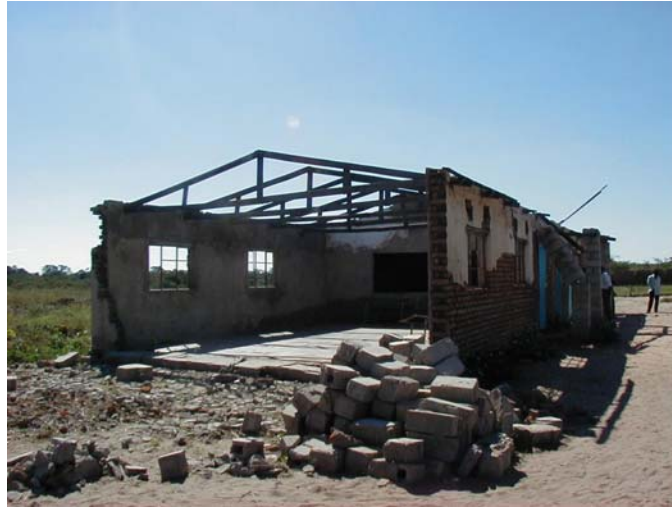
Above, a dilapidated 1 by 2 classroom block at Ngundi. Below, a new classroom block at Ngundi built with funding from the Zambia Initiative.