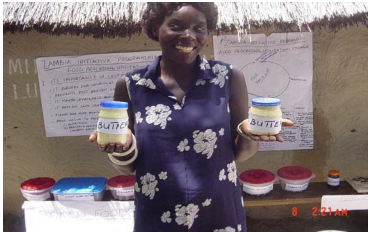
Above, a Zambian woman displaying some of the food products (Butter) produced under the income generation programme at Lui-Wanyau in Senanga District