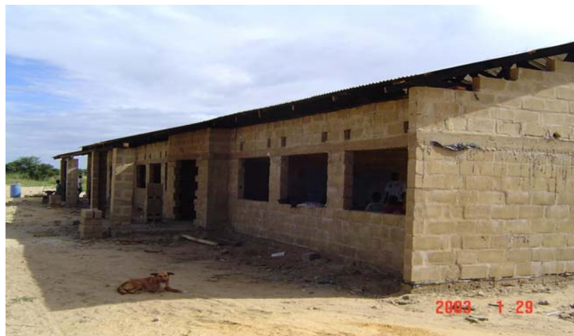
A 1 by 3 classroom block under construction at Senanga Orphan day care centre.