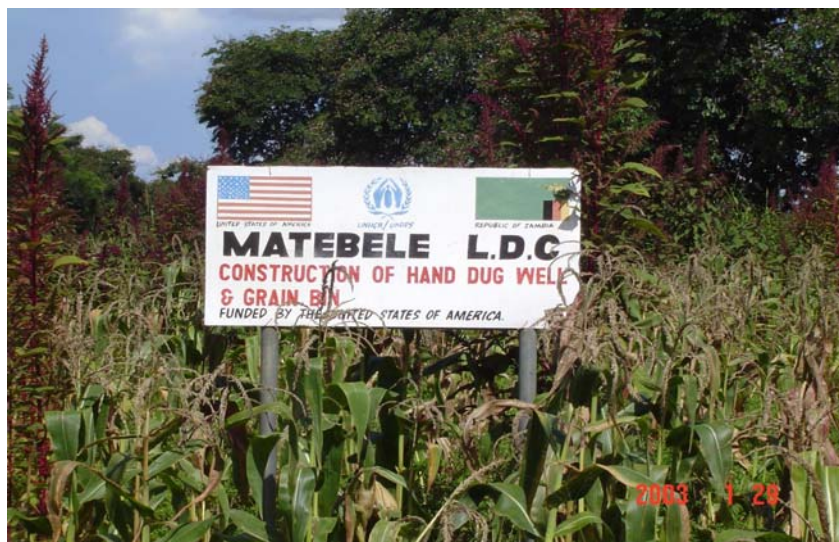
Food security has also been promoted by encouraging LDCs to practice winter cropping in the dambos.