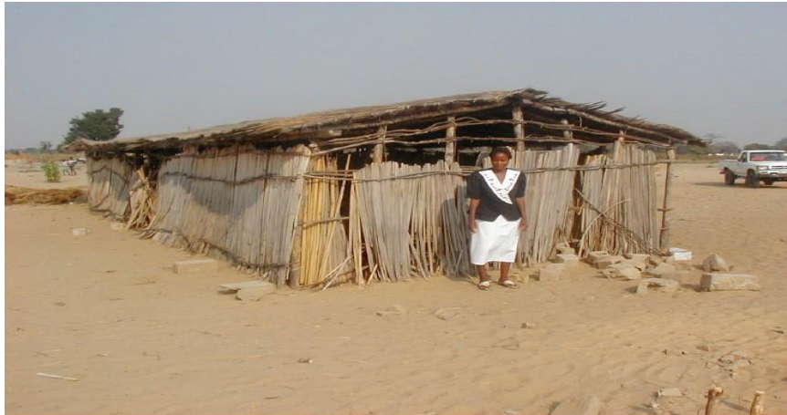
A thatched school in Senanga District (Senanga School for Orphans) before intervention of the ZI. Opposite-bricks for construction