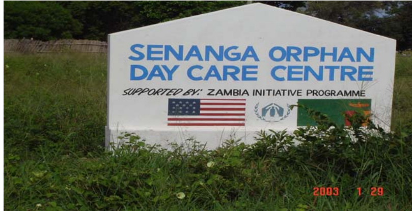
Senanga orphanage day school