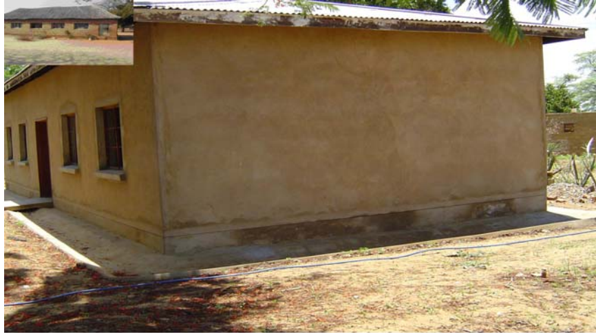
Above is a rehabilitated wood workshop at Senanga Trade School for drop out. The insert at the far left depicts an old structure with leaking grass thatched roof before ZI embarked on rehabilitation. Only final touches are remaining to complete the rehabilitation works