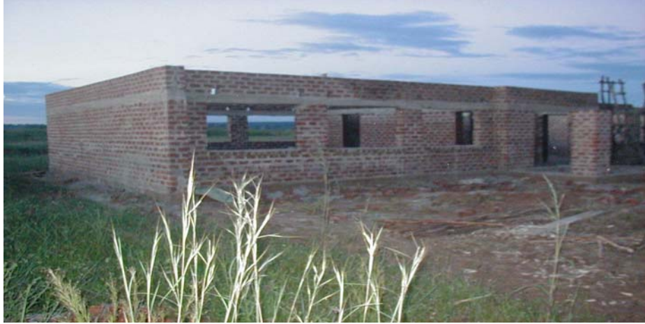
Construction of the 1 by 3 classroom block at Mayukwayukwa high school under construction, and the building is at roof level.