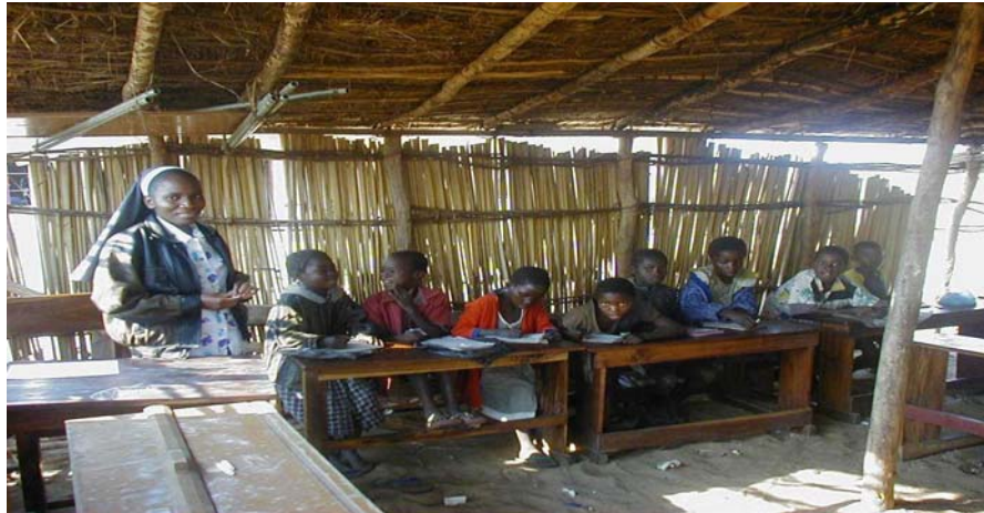
Pupils at the Orphanage centre, in the Senanga District in grass thatched classroom (before the implementation of the ZI).

the target communities composing of 50% refugee participation where there is high concentration of refugees and 25% participation in target areas where the refugee presence is not high. The tasks of these LDCs are to identify, implement and manage projects. Each LDC covers some 6-10 villages comprising of elected village representatives, including traditional leaders.