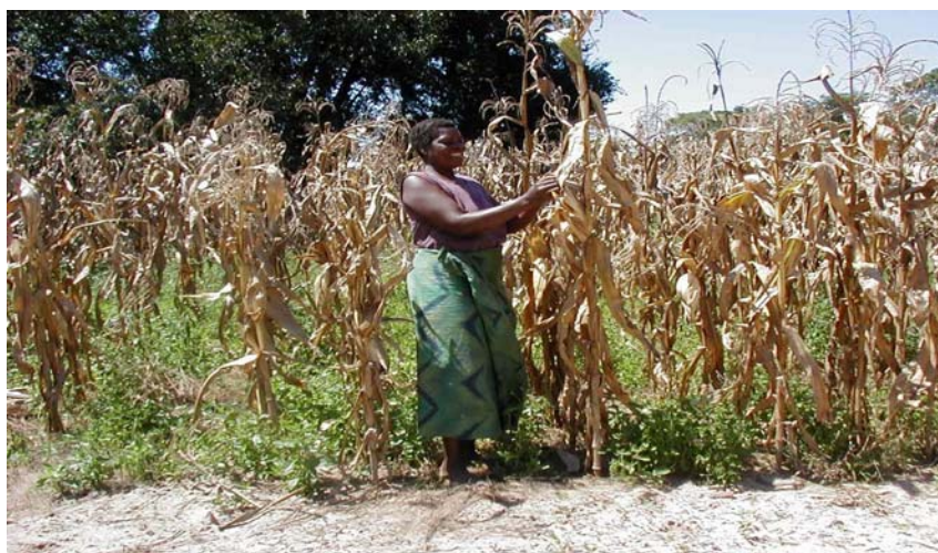
An LDC member in Shangombo inspecting her field. She benefited from the rural credit and she is expecting a bumper harvest.