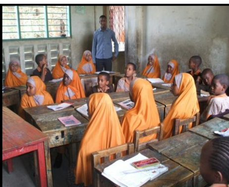
Kenya: Former DAFI scholar with his third class pupils