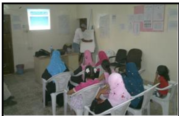
Yemen: DAFI scholars with students and parents during HIV and environmental awareness campaign