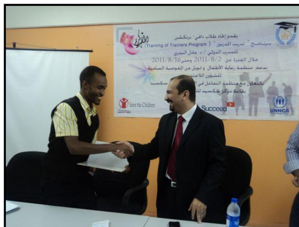
Yemen: workshop for DAFI students