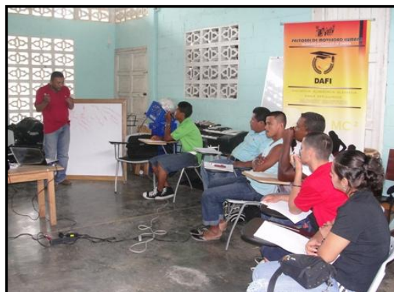
Panama: workshop with DAFI students