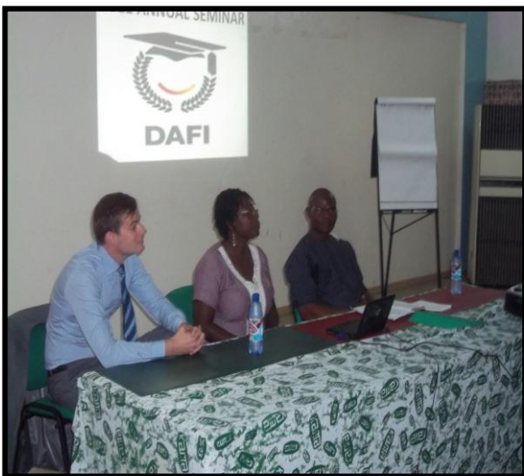
Ghana: DAFI Workshop with a representative from the German MFA