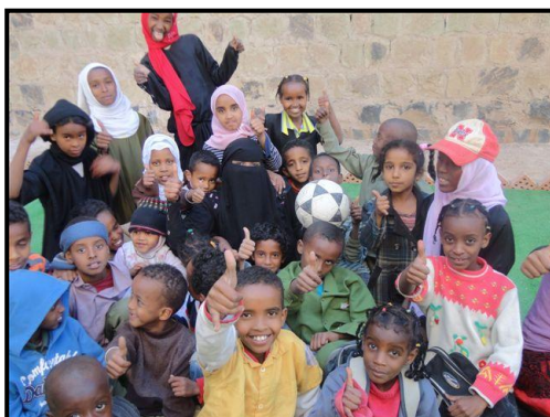
Yemen: Former DAFI pharmacy student working in a drop out center