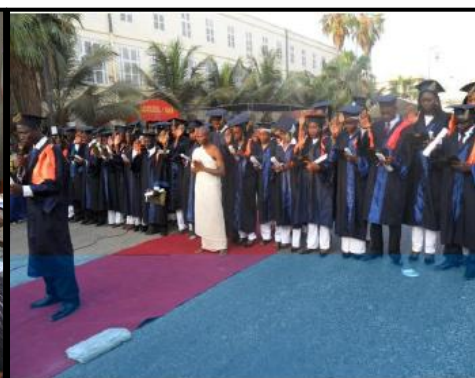
Senegal: Graduation ceremony

“The hope for further education is what made me what I am today.”