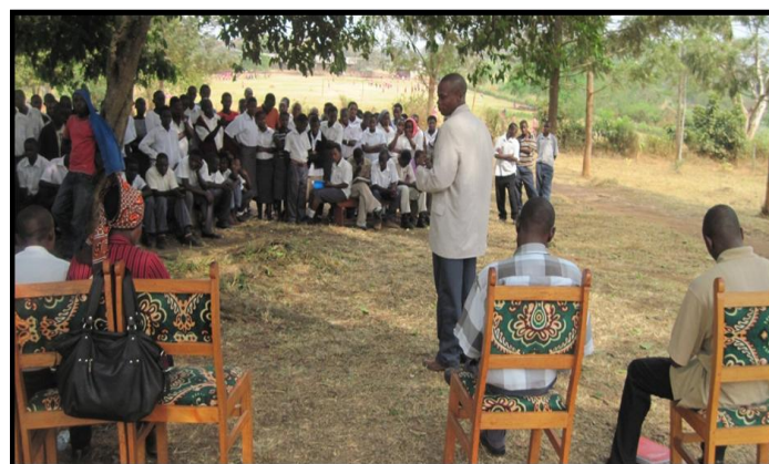
Uganda: DAFI Students on the occasion of donating exercise books and stationery to secondary schools students in Kyaka II refugee settlement

A " CV writing skills " workshop helped final year students to write effective job application letters and CVs and to develop good interview presentation skills. A second seminar targeted continuing students and covered the topic "Leadership and Entrepreneurship" intended to encourage participants to think of contributing to fill leadership gaps in their communities. A focus was also placed on Entrepreneurship to develop ideas on self-employment after graduation.