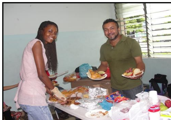
Panama: Celebration of the closing of the academic year 2011 with Christmas lunch and gift exchange