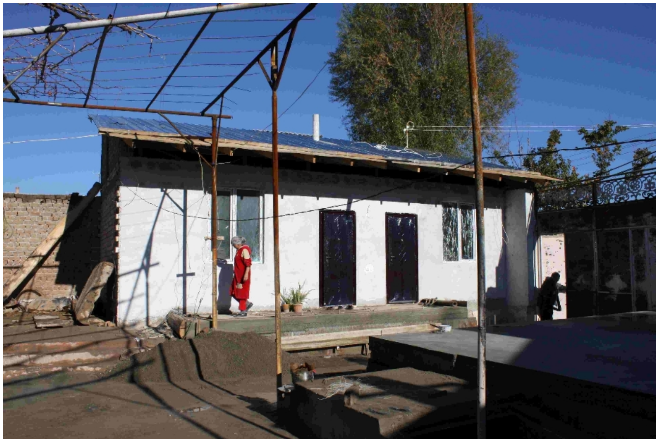
Shelters built by UNHCR are warm, safe and durable.

27,600 blankets, 5,300 kitchen sets, 9,600 jerry cans, 5,700 plastic sheets, 7,800 sleeping mats, 2,200 buckets, 1,600 mattresses, 2,600 family tents, and a variety of other relief items.