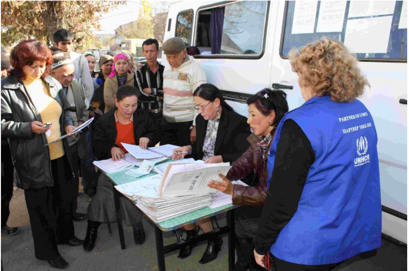
A mobile team of NGO lawyers and authorities helps in restoring documents.