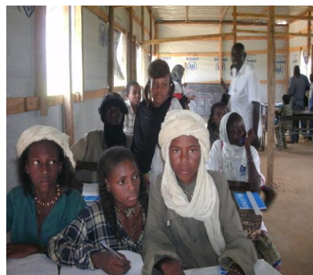
Catch-up classes ended September 20 in Intikane hosting area where 140 children, including 65 girls benefitted from this programme. UNHCR/ September 2013/ Niger.

**UNHCR public website: http://www.unhcr.org/pages/4f79a77e6.html