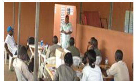
Training of security personnel stationed in the camps of Sag-Nioniogo, Mentao and Goudoubo in Burkina Faso.

In Mali, some 16 trauma centers have been established which are providing psychosocial counseling to survivors in Segou, Mopti, Gao, Timbuktu and since August in Kidal. To date, a total of 1,489 persons, including 879 women, have been reached through sensitization campaign implemented by GREFFA partner. In addition, radio debates on SGBV prevention have been co-animated and some 245 broadcast awareness messages on SGBV (in Bamabara, French, Songhai and Tamashek) have been broadcasted on radio stations in Segou, Diabaly, Timbuktu. To extend identification of survivors and strengthen the response on legal assistance, a new sub-agreement has been signed with "Association des Juristes Maliens".