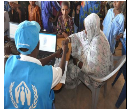
A refugee has her finger prints taken during the registration level III operation in Sag-nioniogo refugee camp.