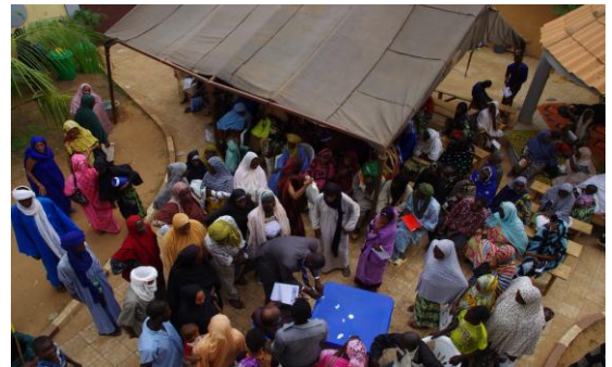
Aerial view of One Stop Shop in Niamey: September 10, 2013

In Mauritania , UNHCR and LWF partner continued the construction of semi-permanent structures for UNHCR Post, registration center, and a community center for youths and women. To date, a total of 9,567 tents installed, 9,176 semi-permanent shelters built. Construction of the four windbreaks by four groups of women in the camp is underway. It will help to protect collective cooking spaces against the risk of potential domestic fires.