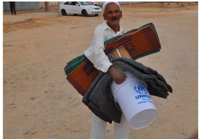
A 70 year old man receives critical life sustaining items at a distribution for displaced individuals from Warshafaini on 16 August. He supports seven family members and shares a house with a host family.