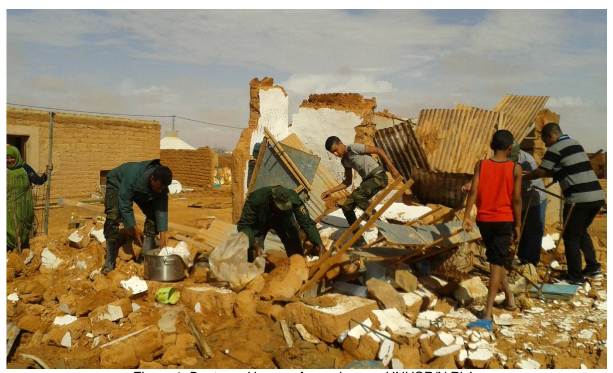
Figure 1: Destroyed house, Awserd camp.

The humanitarian partners already present in the camps are quickly responding to the crisis. Thousands of bottles of drinking water along with fresh food commodities are being distributed and emergency family tents airlifted, and other relief items. To respond to the most urgent humanitarian needs and to avoid long-term negative consequences of this crisis, the response needs to be further expanded in a rapid and comprehensive manner.