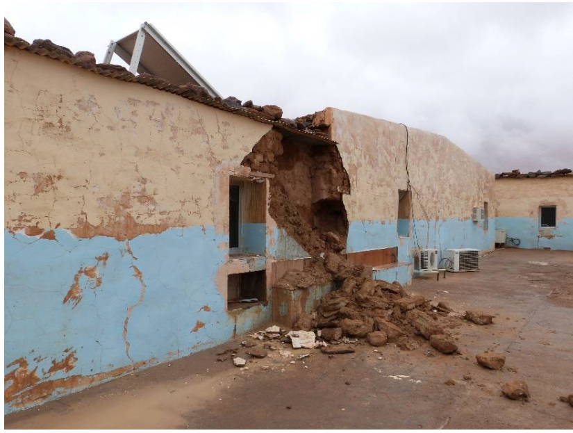
Figure 3: Structural damage to pharmacy, Dakhla camp.

UNICEF and WHO will focus on the needs of the most vulnerable refugees, with particular attention to women and children. As an immediate response, they will provide basic emergency obstetric and newborn care kits, crucial drugs for de-worming, vitamin A supplements, and temporary spaces (e.g. large tents) to enable beneficiaries to have access to health care. Moreover, in close collaboration with the hospital in Tindouf, the stocks and appropriate storage of needed vaccines will be assured. In addition to its existing interventions in support of the health sector UNHCR will fund the rehabilitation of all five hospitals damaged in the floods. The three agencies (UNHCR, WHO and UNICEF) will also jointly support the rehabilitation of some of the most damaged health centres. This intervention will be enabled by a strategic partnership with the Sahrawi refugee community.