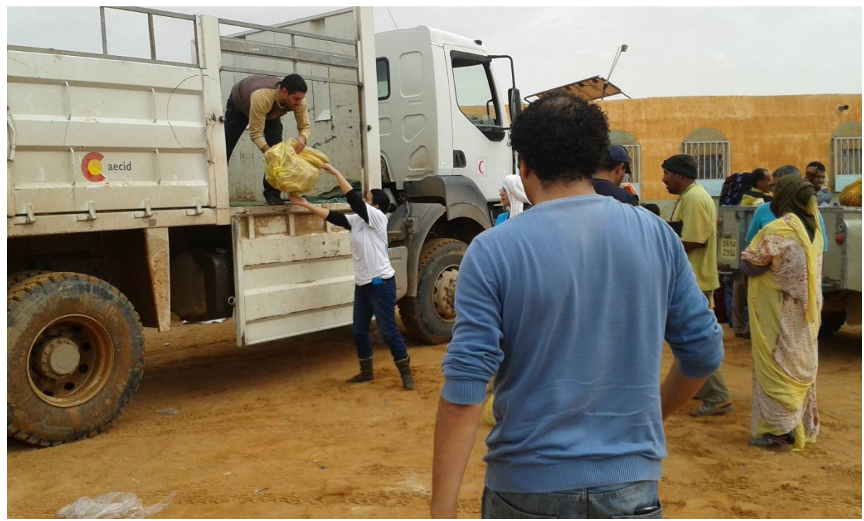
Figure 2: Bread distribution in Dakhla camp, 23 October.