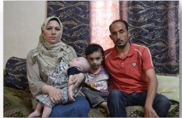
Syrian family in Nouakchott