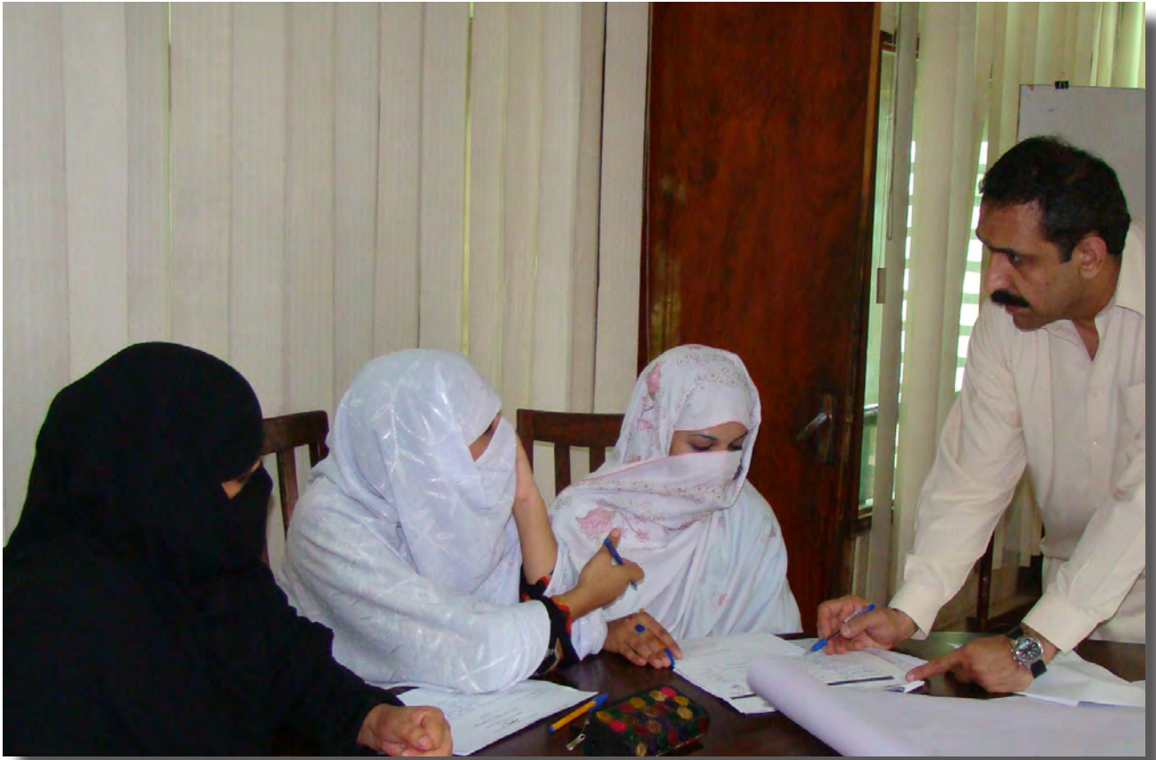
— GROUPWORK DURING THE FOCUS GROUP DISCUSSIONS