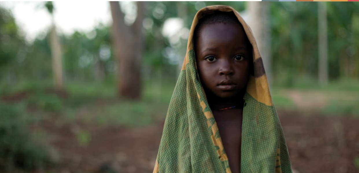
Tanzania / Young Somali Bantu girl in Chogo village. / 2009

Through its Key Initiatives series, DPSM shares regular updates on interesting projects that produce key tools, practical guidance and new approaches aimed to move UNHCR operations forward.